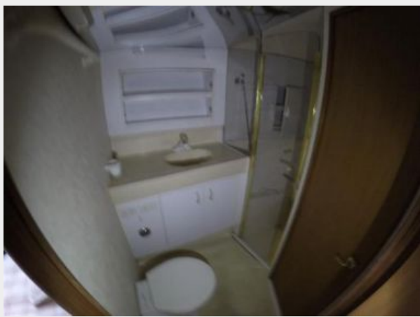
Head / Shower