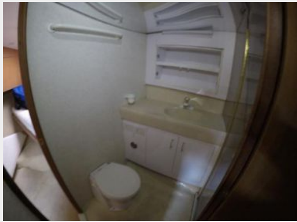
Head / Shower