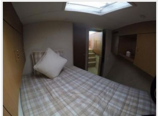
Forward Berth - Facing Aft