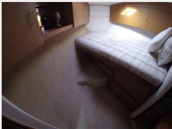
Forward Berth - Facing Forward