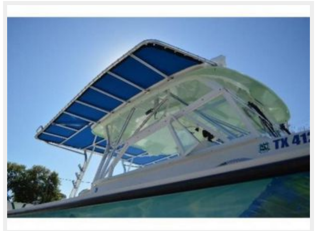
Side profile on trailer