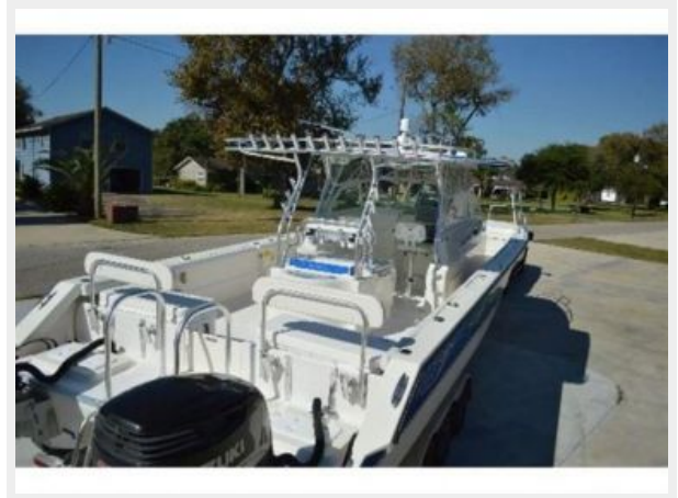
Hull of vessel