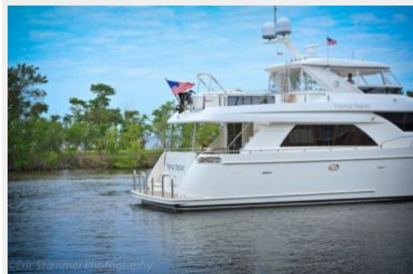
Aft Starboard View