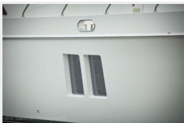
Master Stateroom Hullside Windows