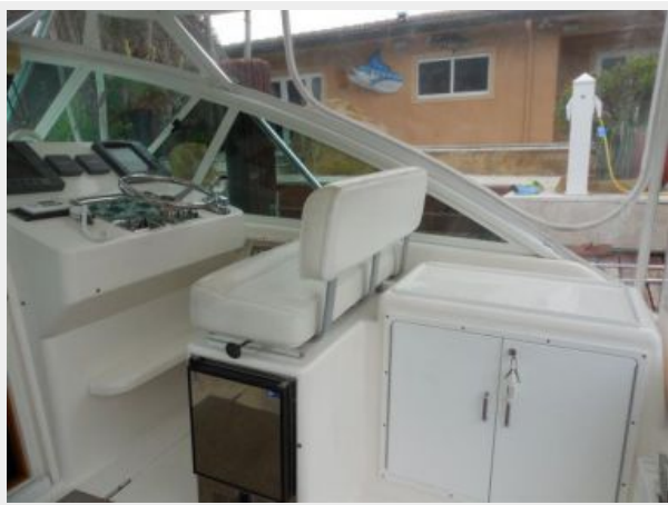
Starboard Helm Deck