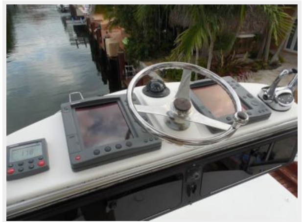
Tower Helm and Electronics