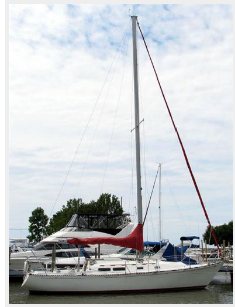
35' C&C starboard profile