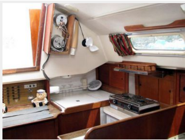
35' C&C galley