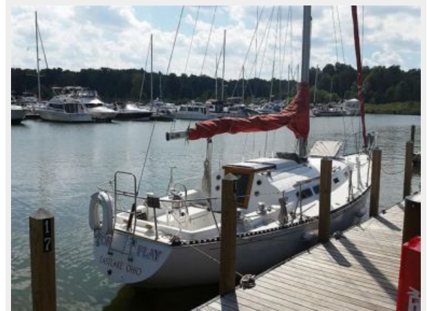
35' C&C aft profile