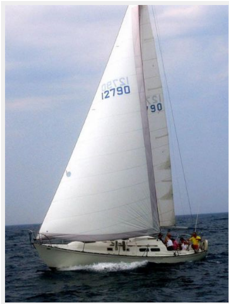
35' C&C underway photo2