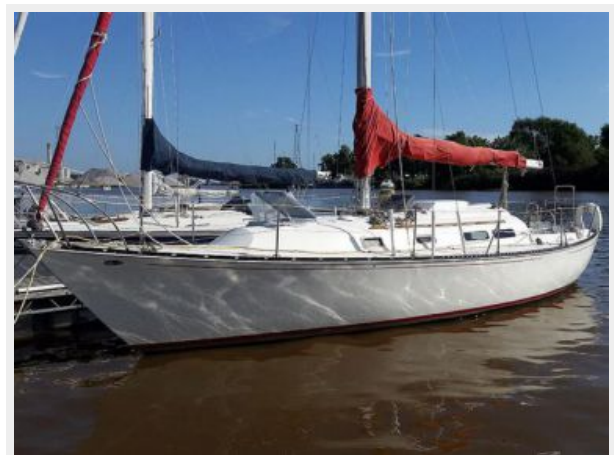
35' C&C port forward profile photo1