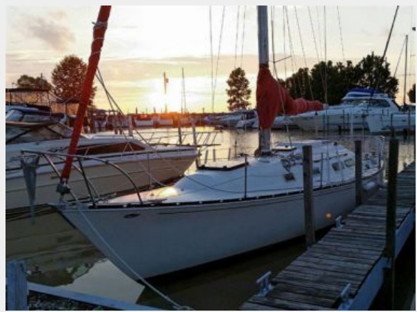
35' C&C Port Forward photo2