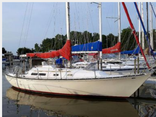
35' C&C starboard forward profile