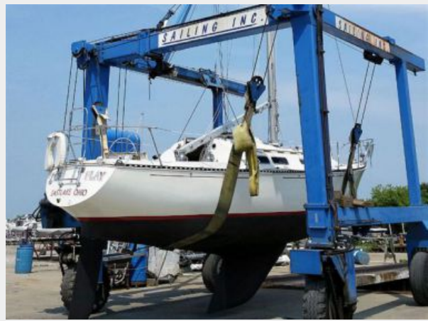
35' C&C hauled out