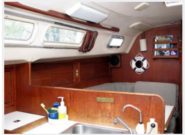
35' C&C salon port forward