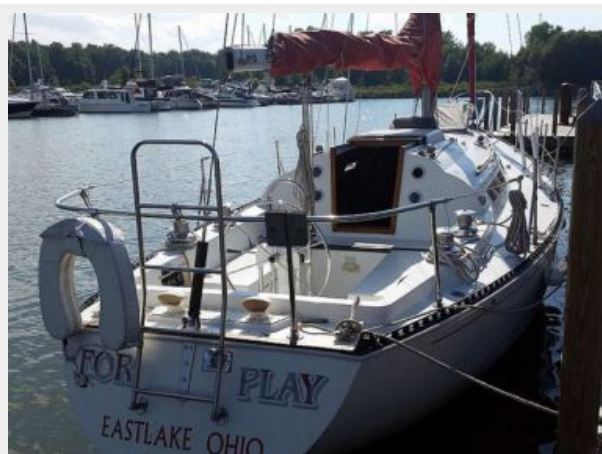
35' C&C cockpit