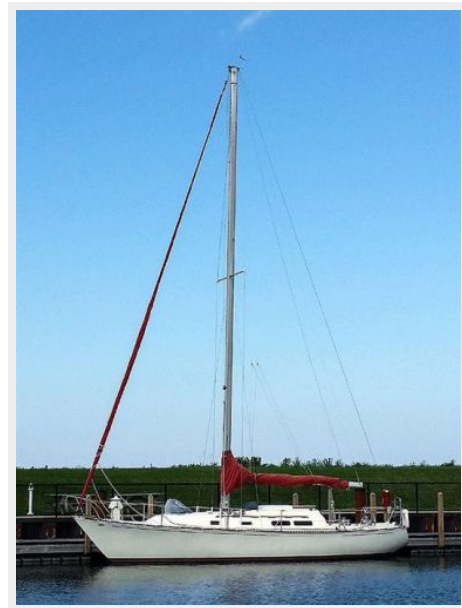
35' C&C port forward profile photo1