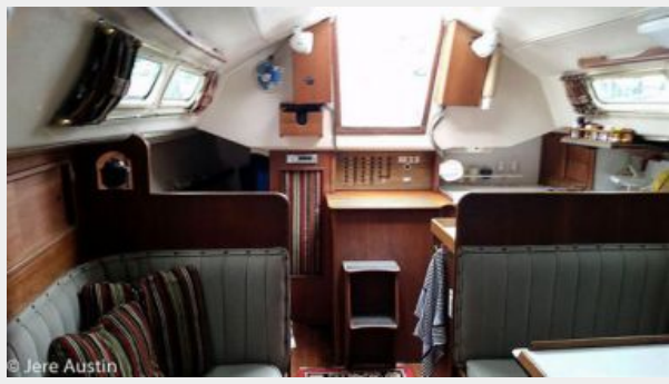
35' C&C salon aft