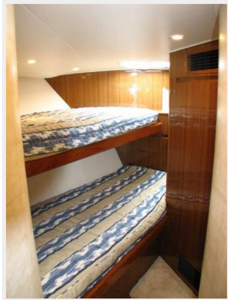
Guest Stateroom, Forward