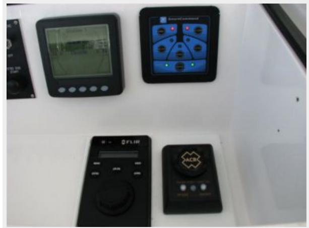
Helm / Electronics & Navigation 6 - Radio Box