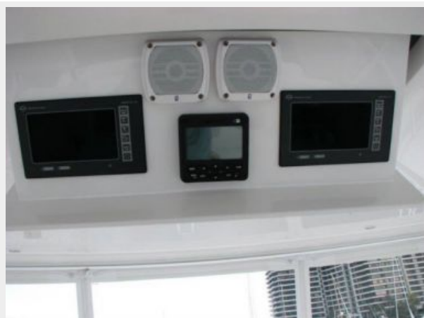
Helm / Electronics & Navigation 7 - Drop Down Box