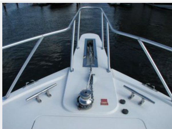
Deck 1 - Bow Pulpit