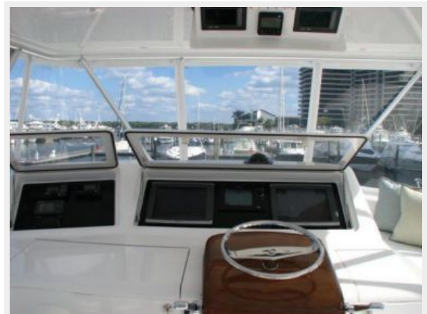
Helm / Electronics & Navigation 2