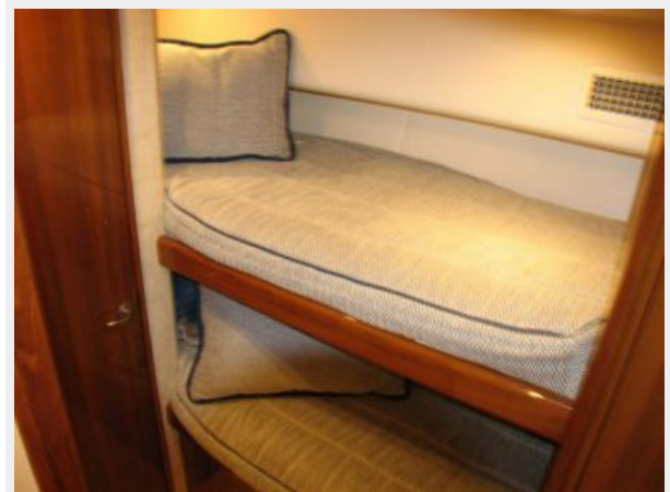
Guest Stateroom, Forward Port