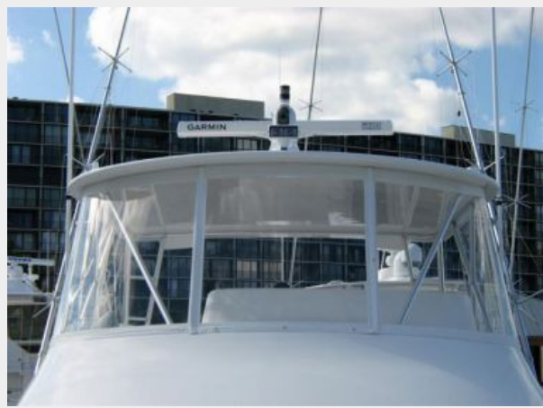
Deck 3 - Hardtop