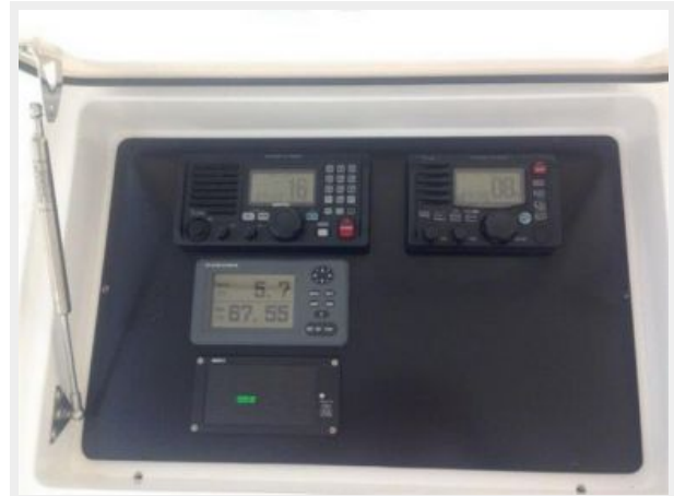
Helm / Electronics & Navigation 8