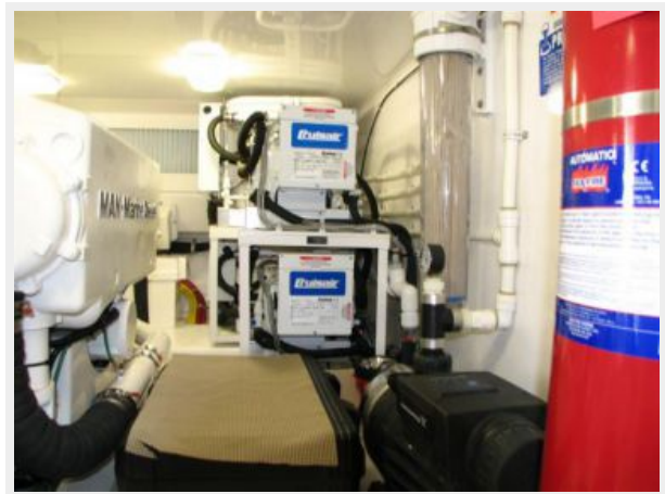
Engine & Mechanical Equipment 5