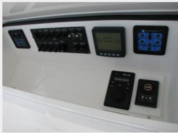
Helm / Electronics & Navigation 5 - Radio Box