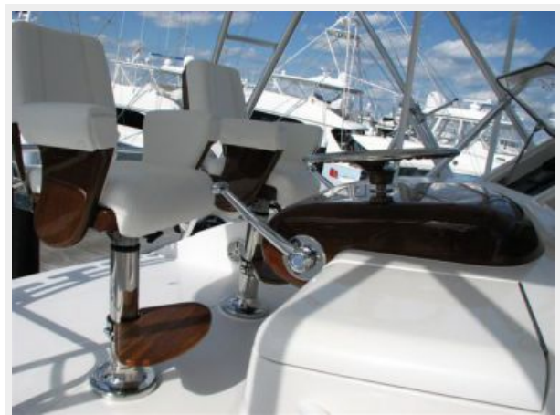
Deck 6 - Helm Seats