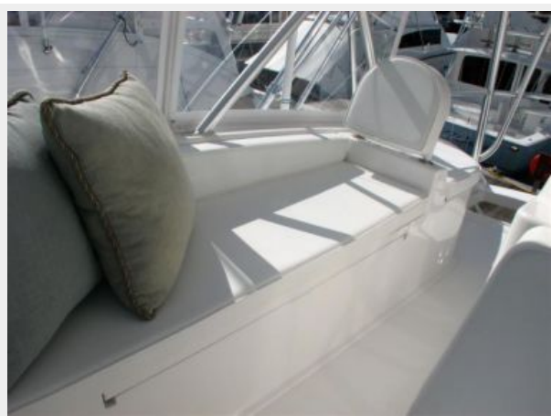
Deck 5 - Starboard Bridge Seating