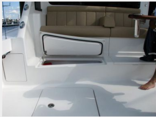
Cockpit / Fishing Equipment 2