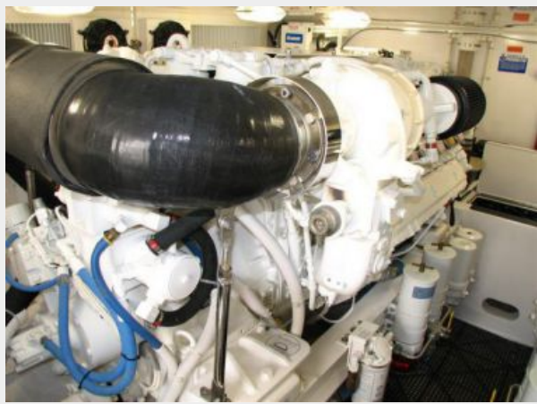
Engine & Mechanical Equipment 2 - Port Engine