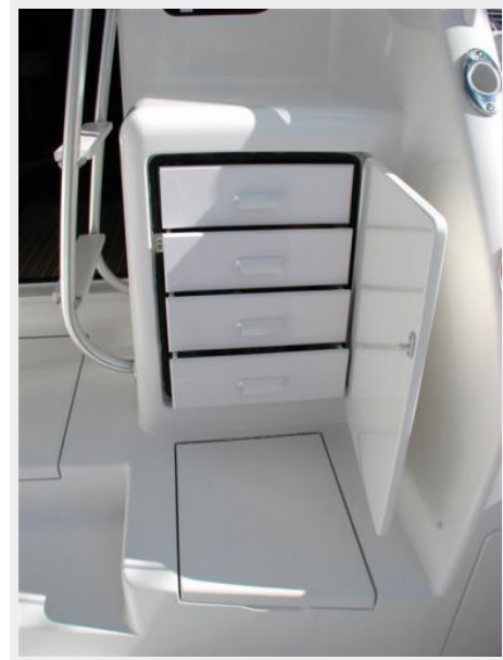
Cockpit / Fishing Equipment 3