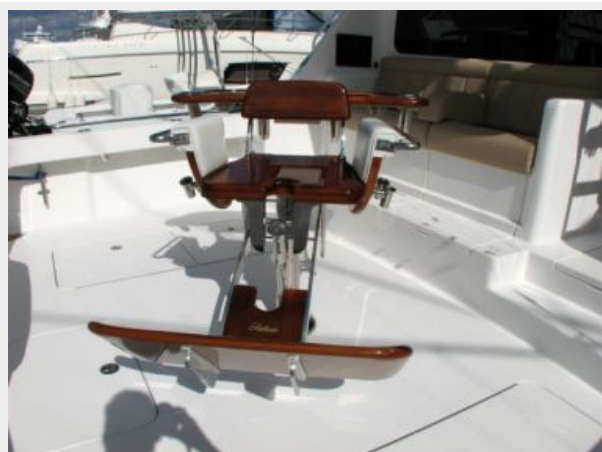
Cockpit / Fishing Equipment 4 - Fighting Chair