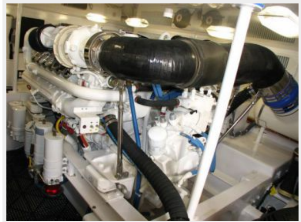
Engine & Mechanical Equipment 3 - Starboard Engine