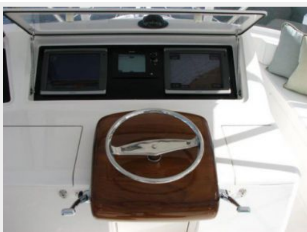
Helm / Electronics & Navigation 3