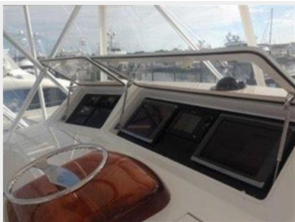
Helm / Electronics & Navigation 1