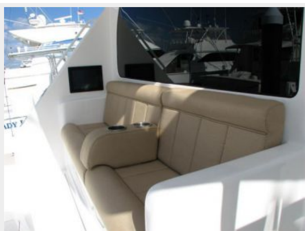
Deck 7 - Mezzanine