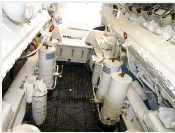
Engine & Mechanical Equipment 4