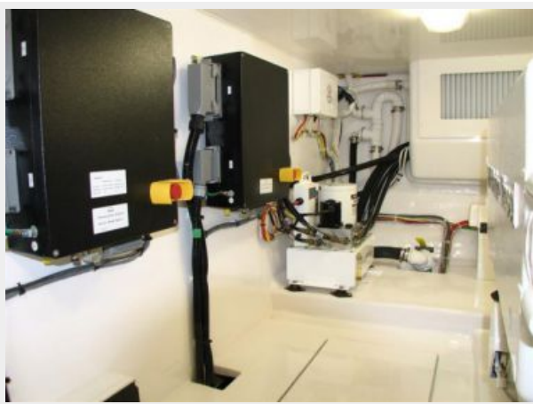
Engine & Mechanical Equipment 6