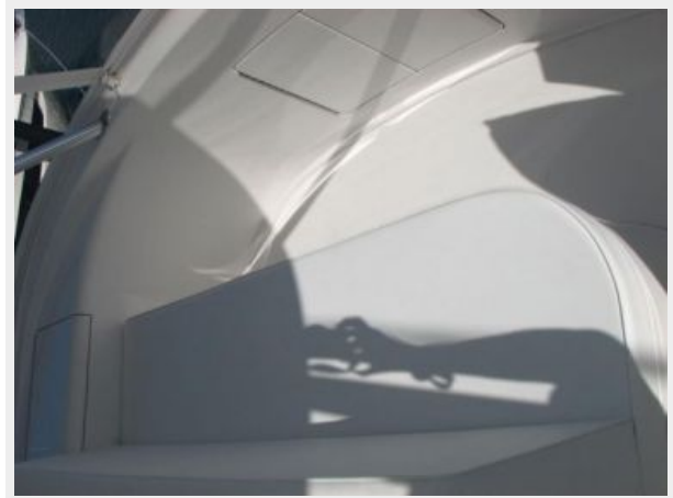
Deck 4 - Forward Bridge Seating