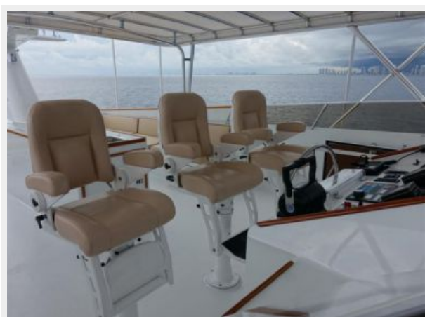
Flybridge / Helm Seats