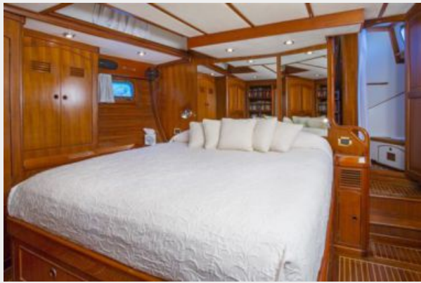
Owner Stateroom Aft