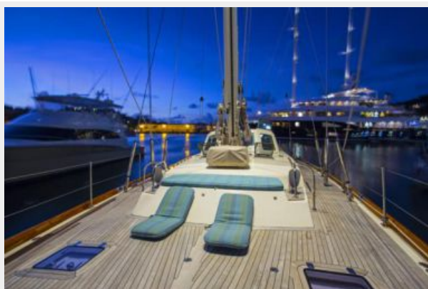
Evening on Deck