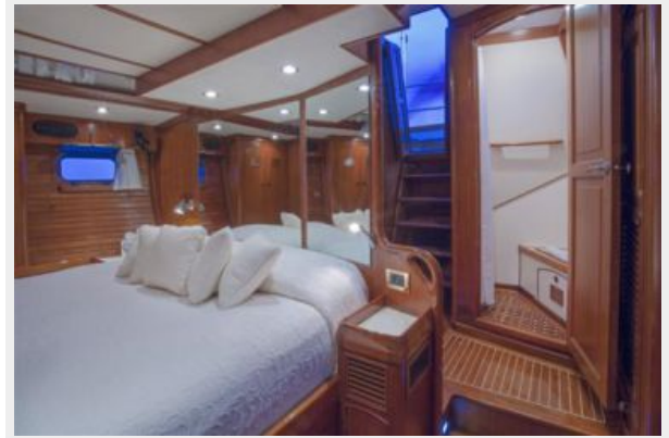
Owner Stateroom Aft