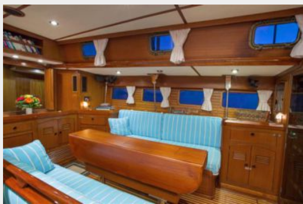
Main Salon Stbd