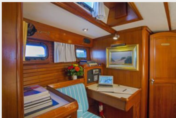
Owner Stateroom Office