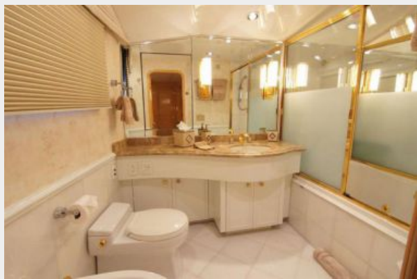
Master Bath Hers