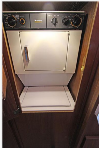
GE full stack washer/dryer