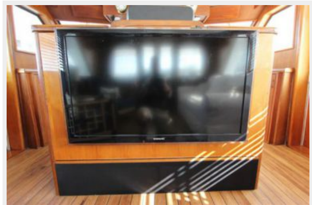
Samsung 42" Flatscreen TV