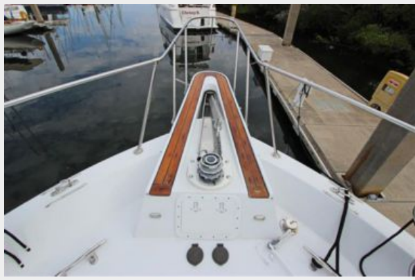
Bow pulpit with stainless Maxwell windlass