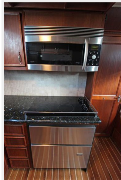
Galley stainless microwave, dishwasher, & 4-burner glass cooktop