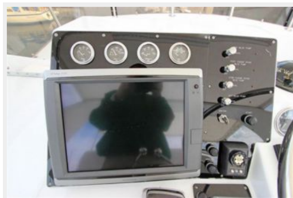
Garmin 7215 touchscreen plotter/sounder/radar