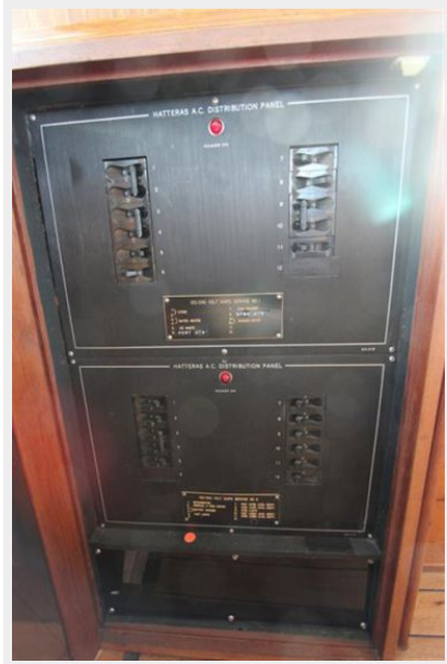
AC distribution panel