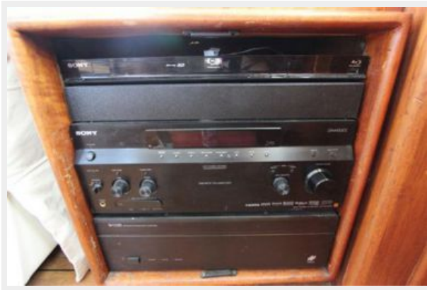
Sony entertainment system for entire vessel