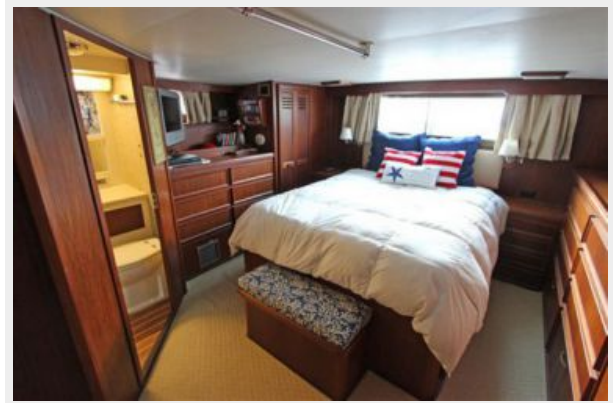
Master cabin w/centerline berth & full ensuite head to starboard