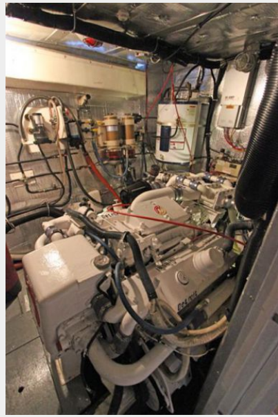
Starboard walk-in engine room