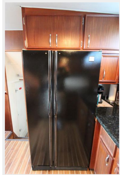
GE full-size refrigerator/freezer w/ice-maker