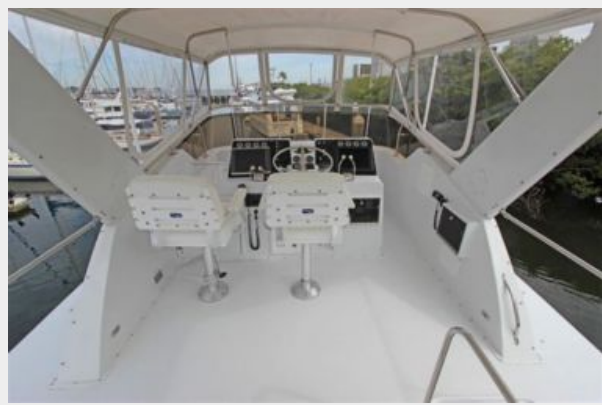
Flybridge looking forward