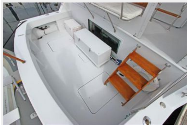
Aft cockpit w/ladder & storage