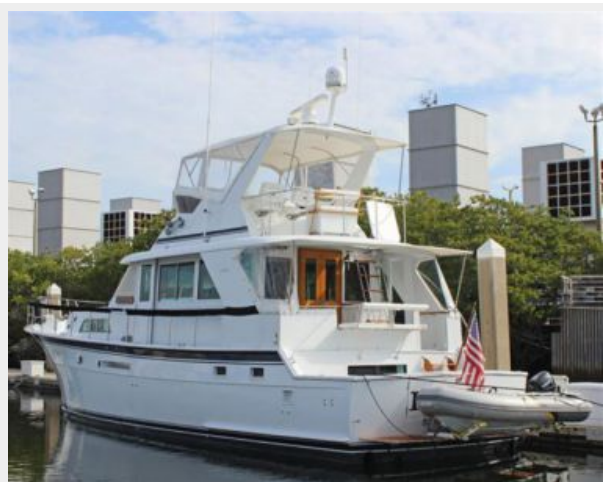
Port Transom View