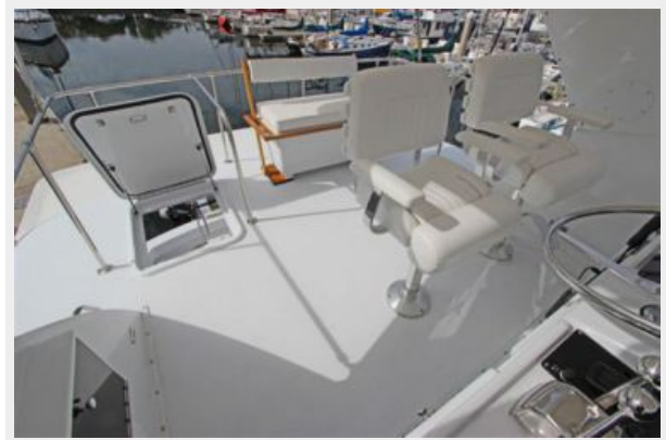
Flybridge looking aft w/Garelick helm chairs