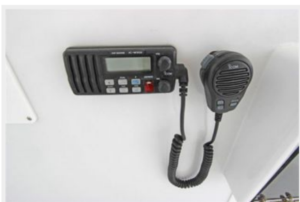
ICOM IC-M302 VHF radio flybridge