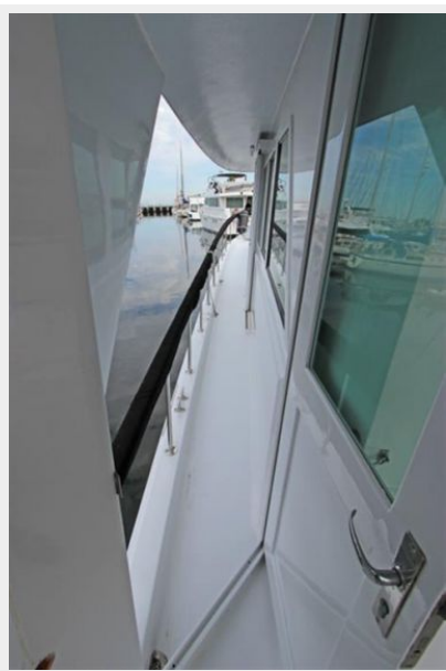
Extra wide side-decks port & starboard for safe movement around vessel