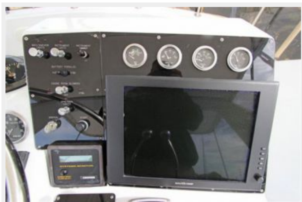
NautiComp repeater for lower station electronics & satellite tv