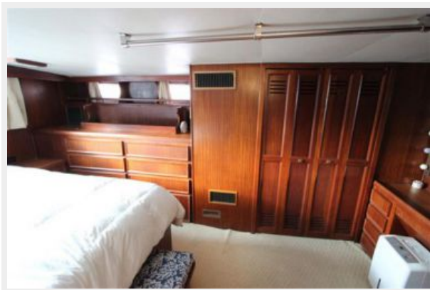
Full hanging lockers to port master stateroom