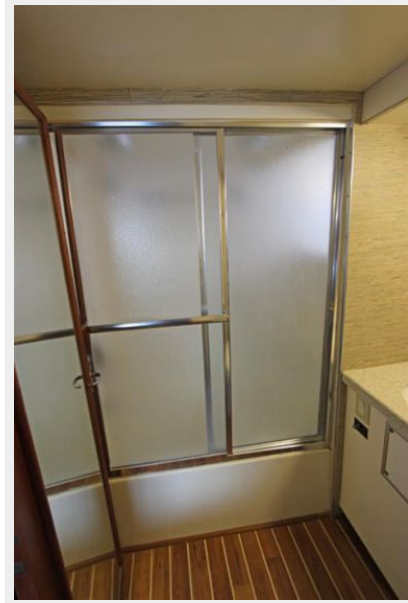
Full master walk-in shower & tub