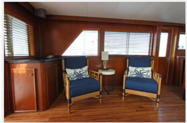
Salon seating & wet-bar to port