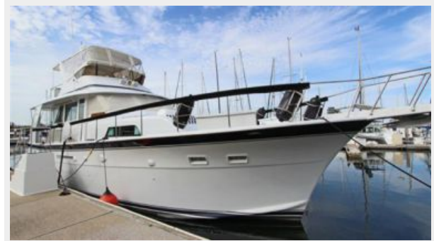
Starboard Bow View