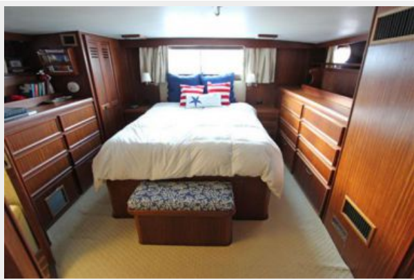
Master cabin looking aft