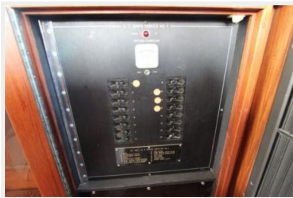
DC electrical panel