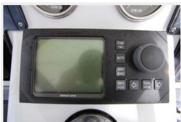
Simrad AP25 autopilot flybridge