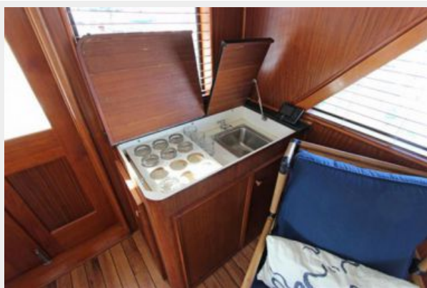
Salon Wet Bar