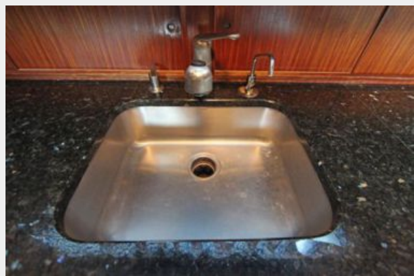
Stainless sink w/disposal