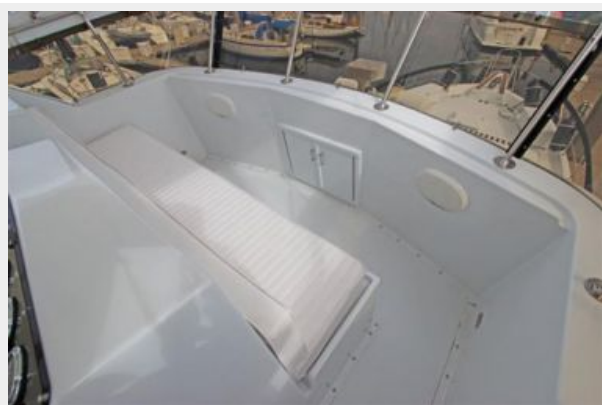
Forward flybridge seating