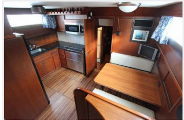
Galley stainless microwave, dishwasher, & 4-burner glass cooktop