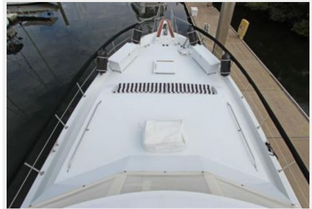
Bow view from flybridge