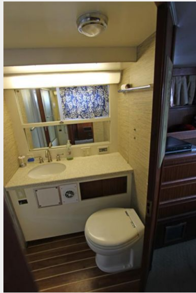
Master head w/Tecma electric marine toilet, Dupont countertops, & full walk-in shower/tub