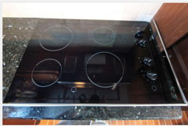
GE electric 4-burner glass cook-top