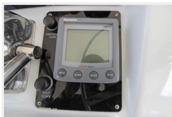
Raymarine ST60+ depth sounder flybridge