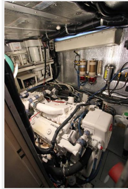
Port walk-in engine room