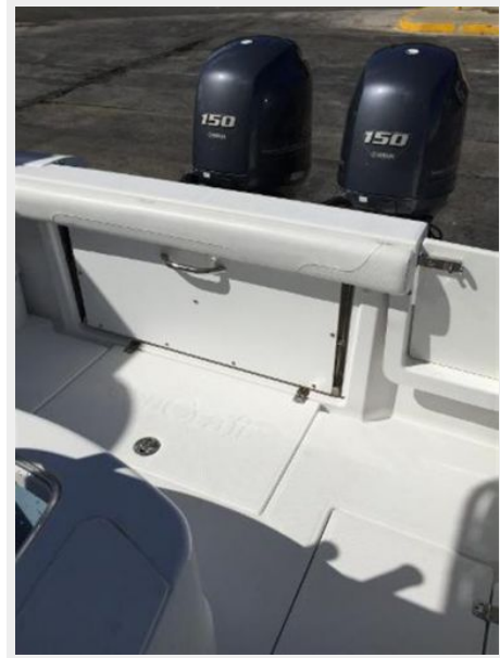
Removable Aft Bench Seat Closed