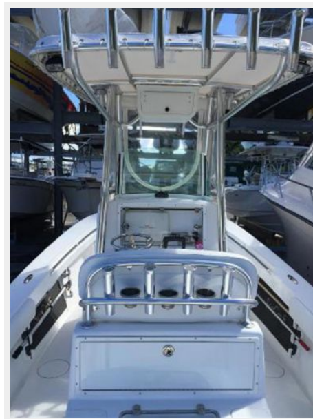
Aft to Fwd View