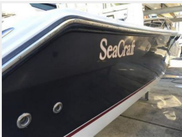
Stbd Side Hull Aft