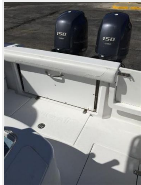
Removable Aft Bench Seat Closed