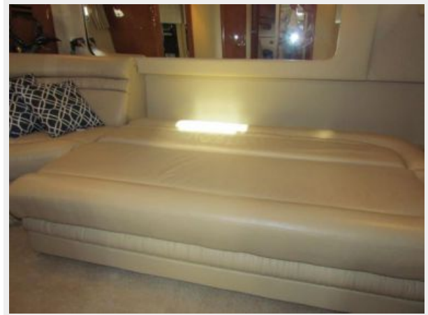
Guest Stateroom Starboard