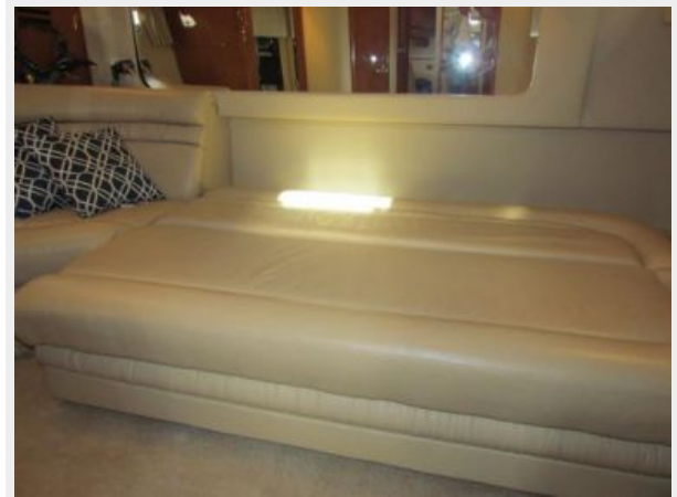
Guest Stateroom Starboard