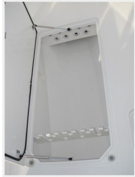
Forward Rod Storage