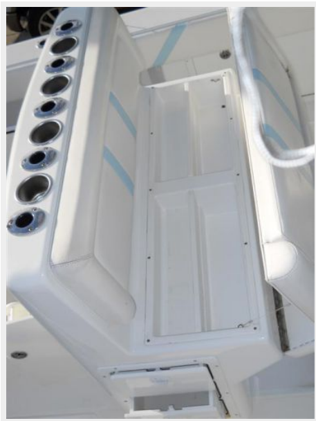
Leaning Post Storage