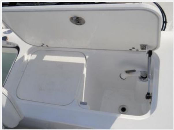
Fresh Water Sink