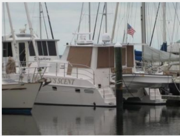
Aft port side view