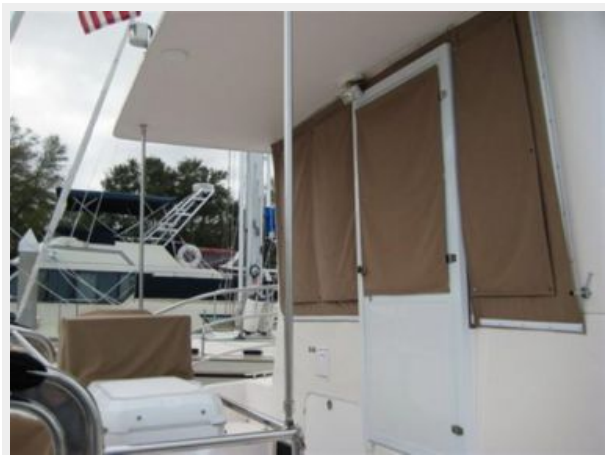
Aft Deck Area