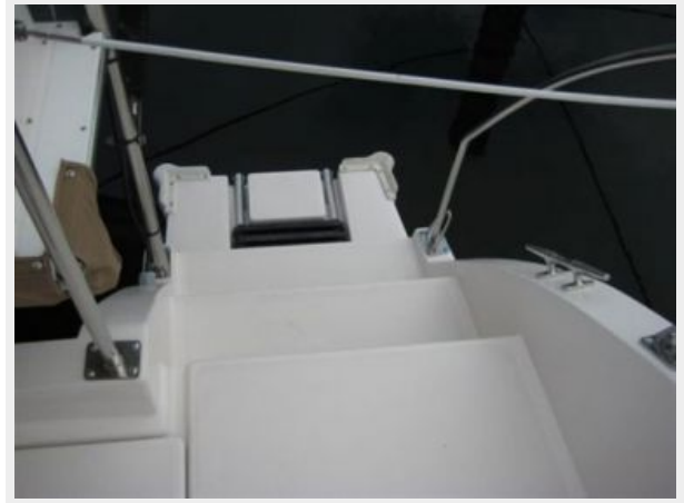
Aft Boarding from water or dinghy