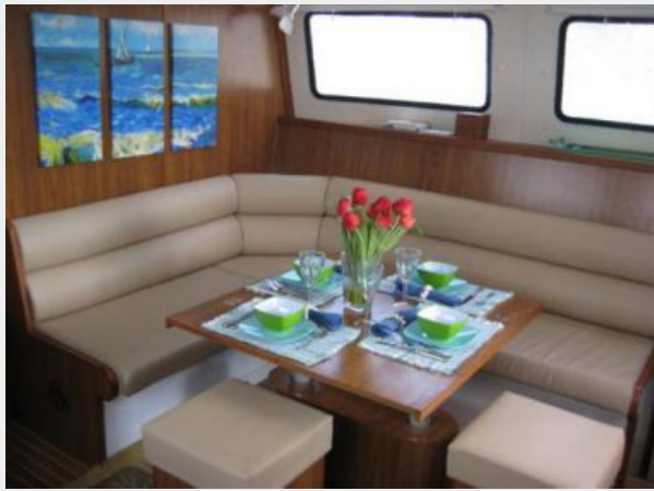
or a cozy foursome...