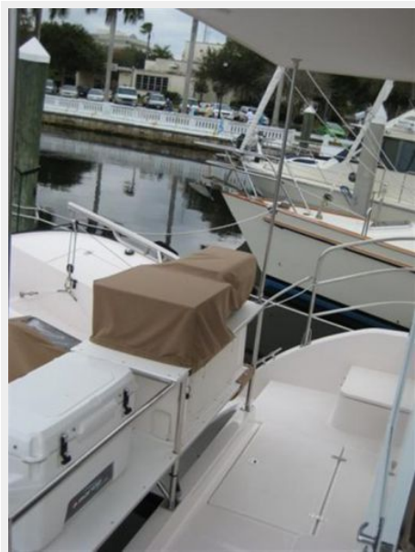
Aft Covered Deck