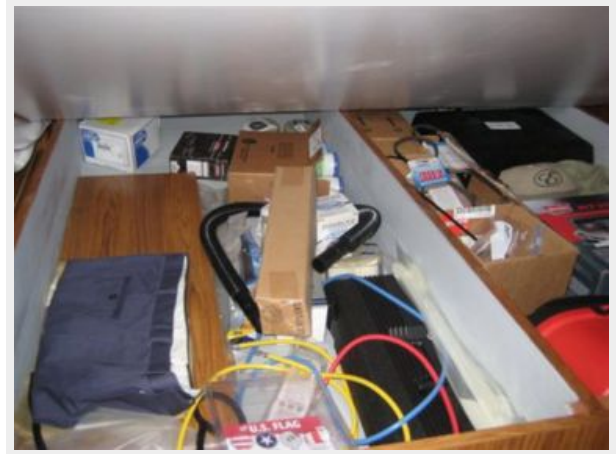
Storage under MSR Berth