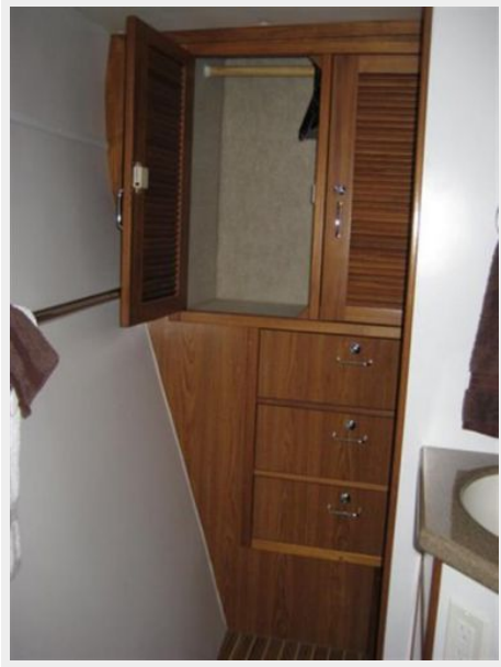
MSR - Additional Storage