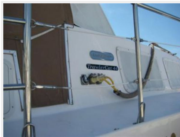
Two 30amp Shore Power Hook-ups