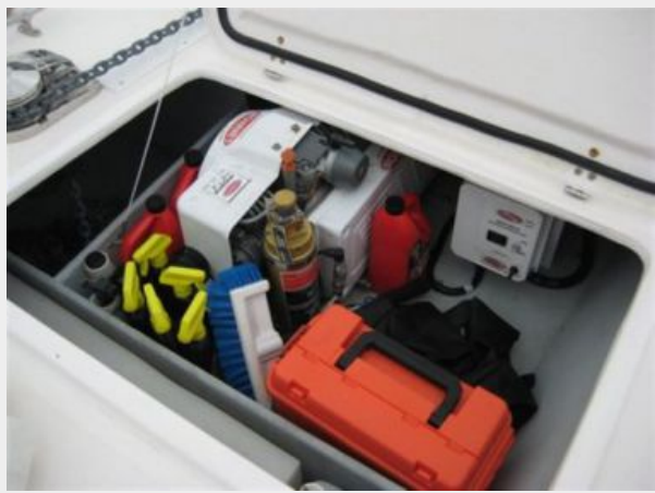
Compressor - Deck Locker, forward starboard side