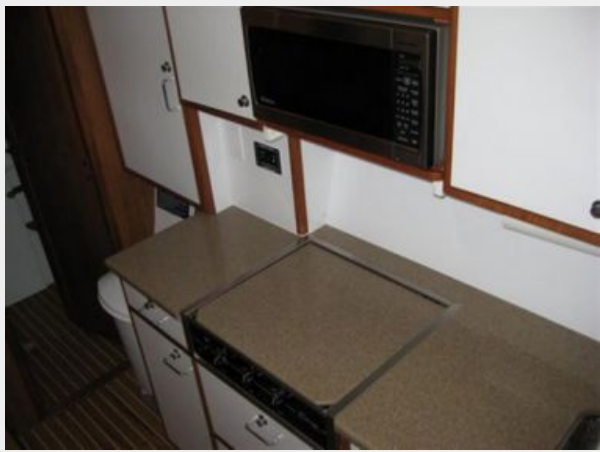
Galley - covered stove