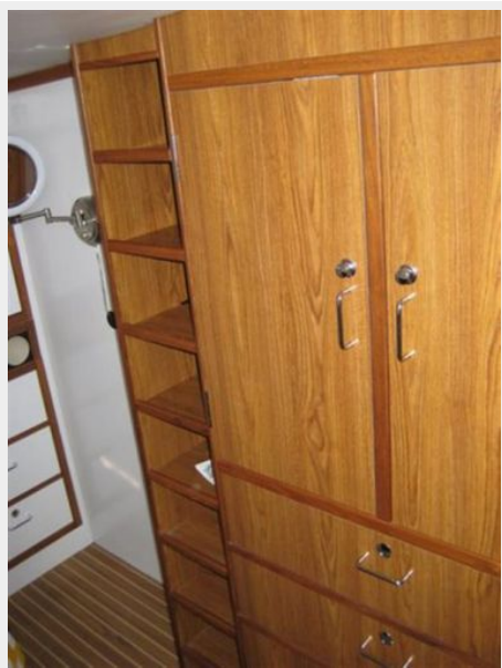
MSR - Wardrobe