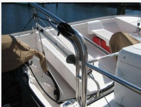
Electric Davit System