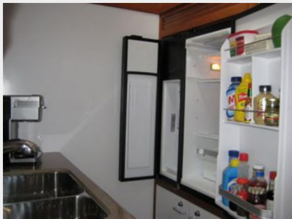
Galley side-by-side Refrigerator