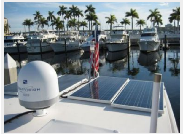
Four 110watt Solar Panels, Tracvision