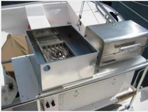
BBQ and Cook top