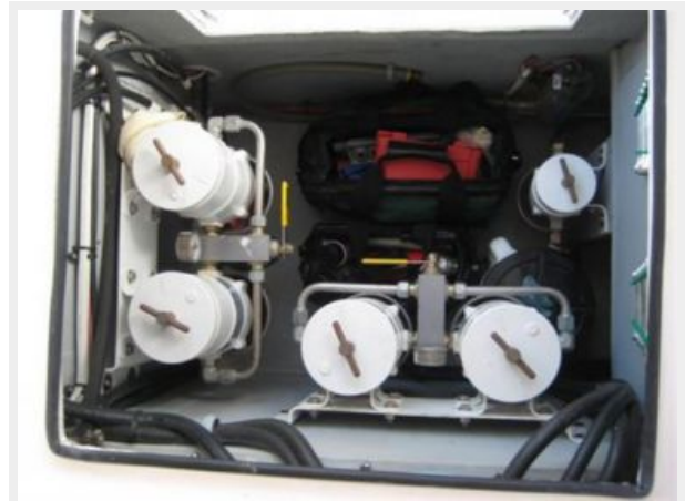
Access to Dual Racors - Engines & Genset