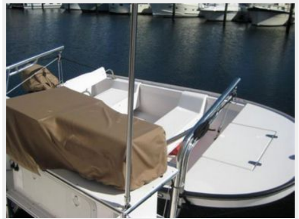
Endeavour 11' Fiberglass Dinghy with Cushions