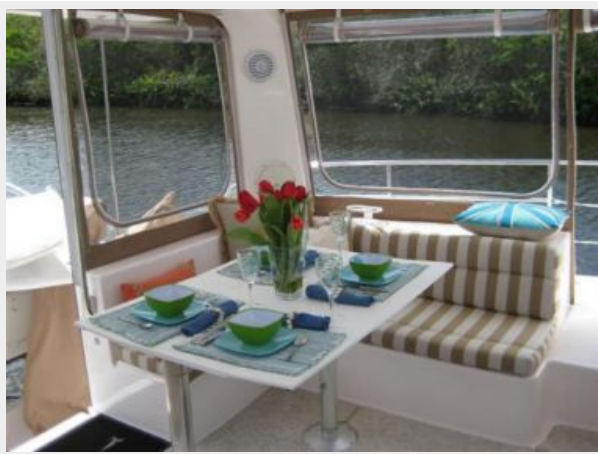
Pilothouse dining for four