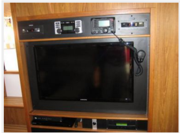
Entertainment Center - Salon