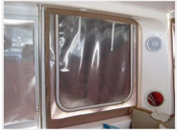
Custom Pilothouse Enclosure