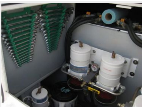
Fuel Line Access and Tools