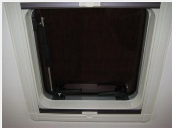
Oceanic Hatch - open