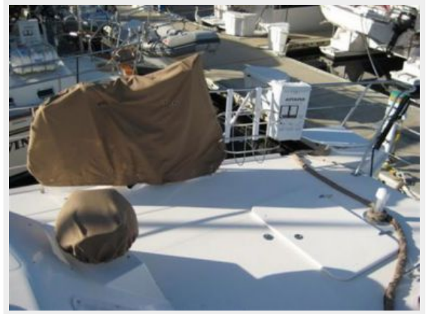
Fore Deck - port