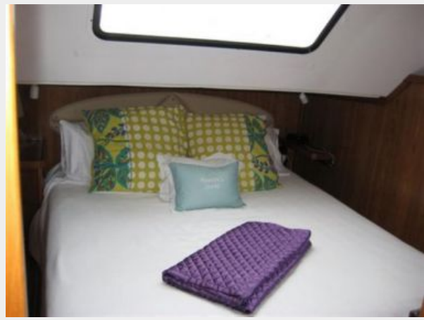
MSR - Queen Berth