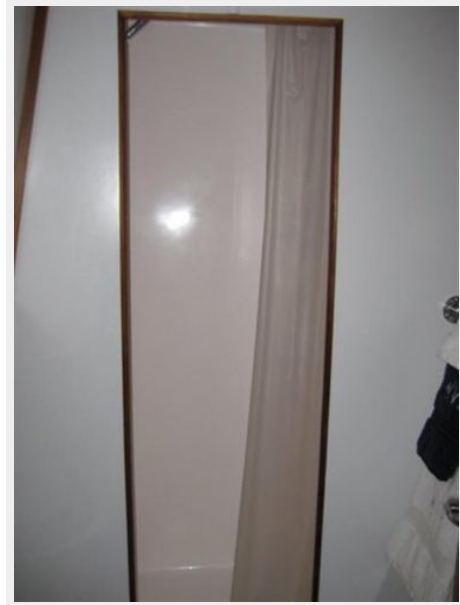
GSR Head - Stall Shower