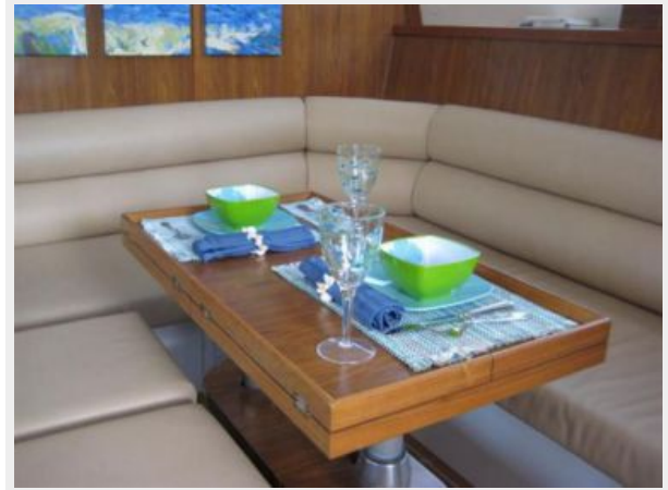
or cozier still!