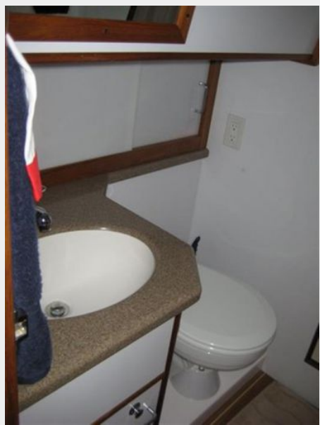
GSR Head - Electric Toilet