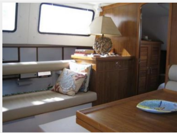
Salon Seating - port side