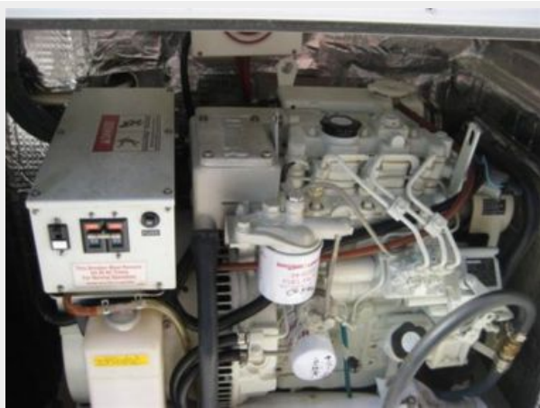
Northern Lights 6kW Genset