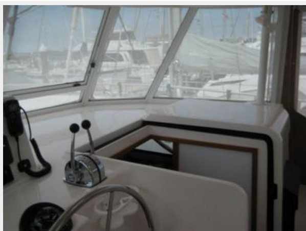
Salon Entrance, Aluminum Windshield