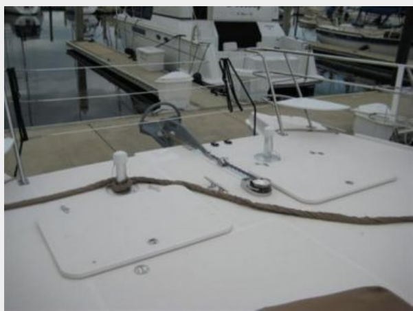
Fore Deck / Windlass