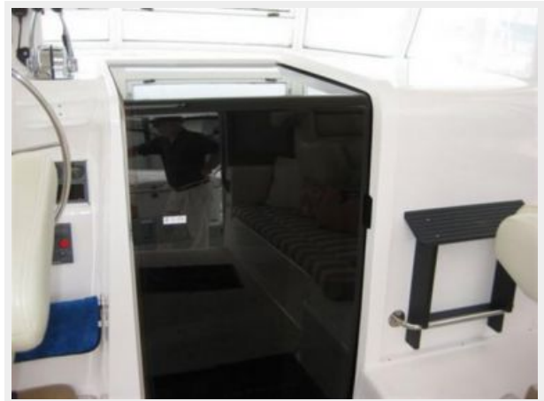
Sliding Lexan Pocket Door to Salon