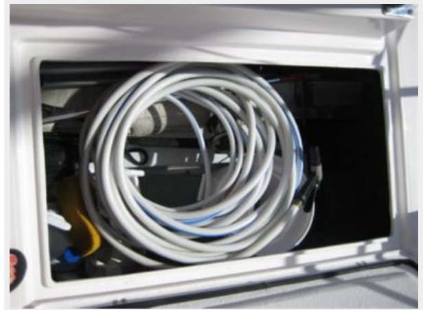
Forward Deck Storage