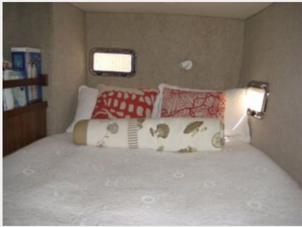
Aft Port Guest Stateroom