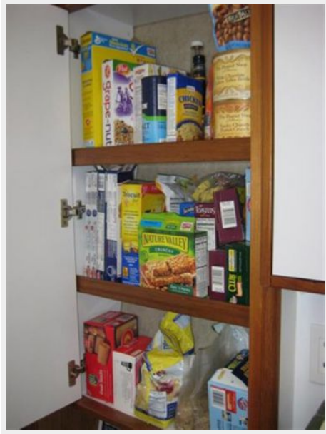
Galley - cabinet storage