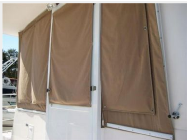
Aluminum Pilothouse Entry Door