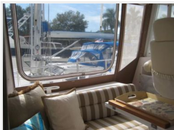
Custom Enclosed Pilothouse-port