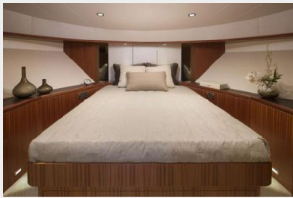
VIP Guest Stateroom