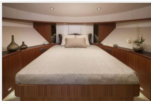
VIP Guest Stateroom