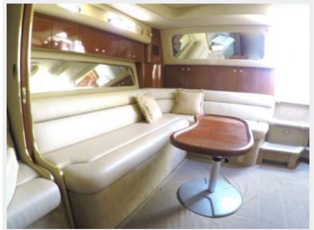
Compounded and wax Feb 2015