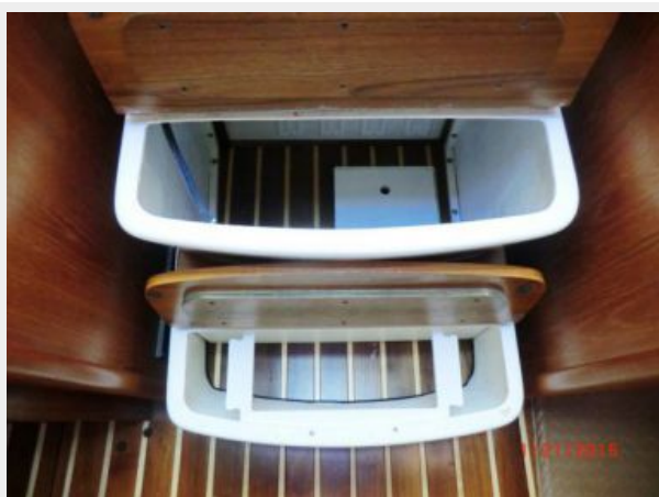
Storage under Steps