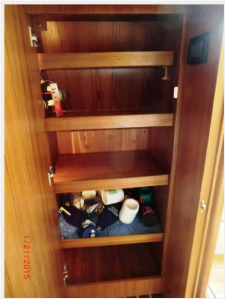
Guest Storage Locker