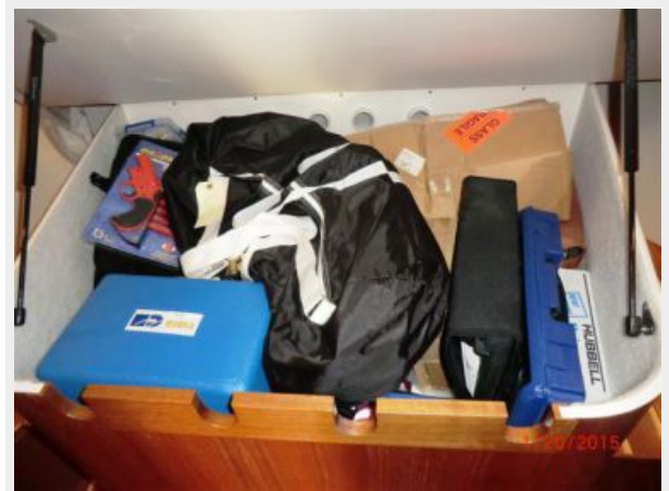
Storage Under Master Berth