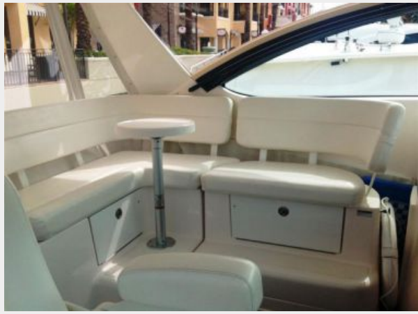
Chart Table and Storage