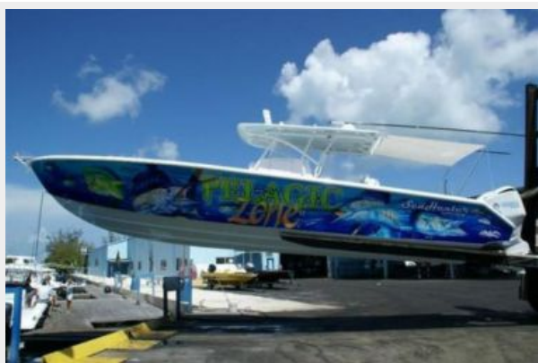
With Removable Wrap