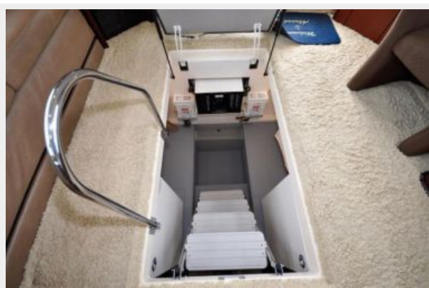
Engine Room Access