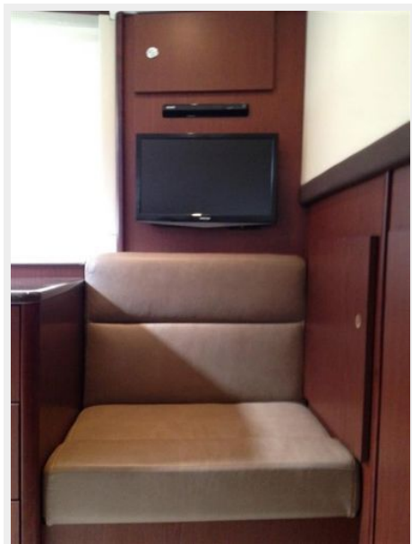
Aft Stateroom TV