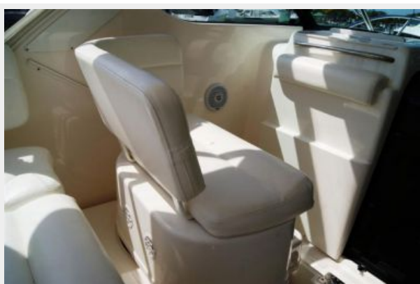
Forward Swivel Seat