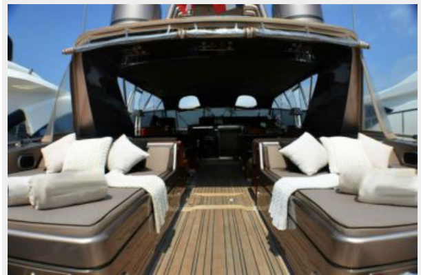
Aft deck sun lounge