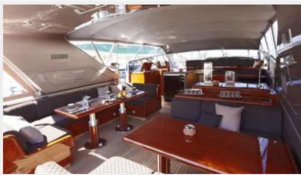
Al fresco dining