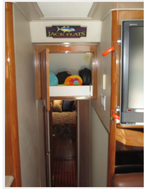
Salon Entertainment Center