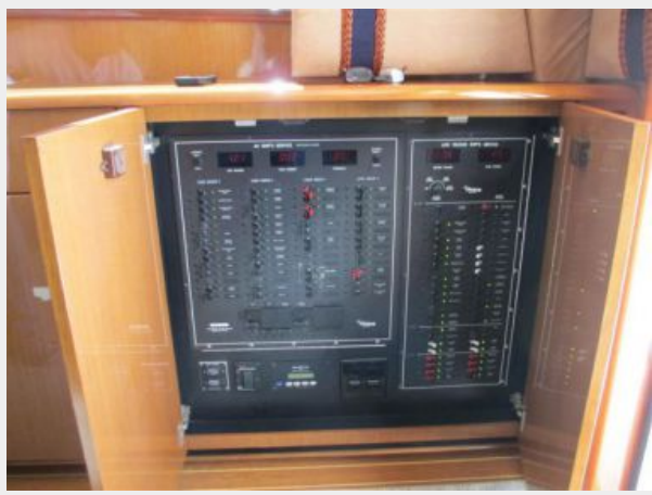
Salon Electrical Panel