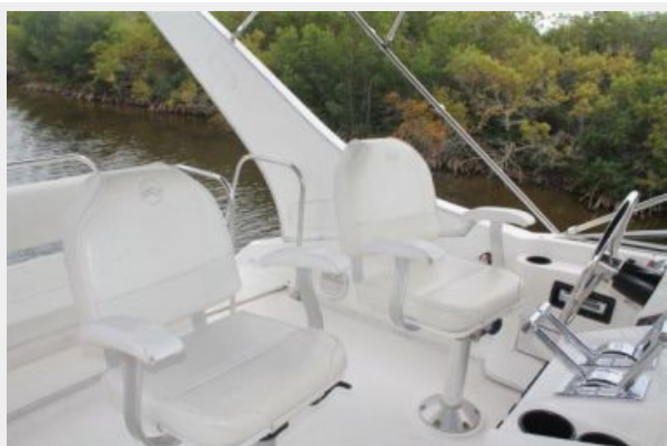
Flybridge Helm Seats