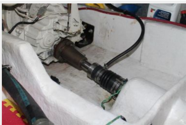
Starboard Shaft and Dripless Seal