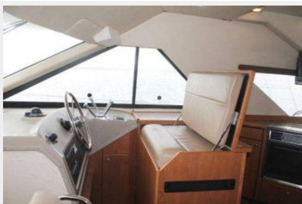
Lower Helm Seat