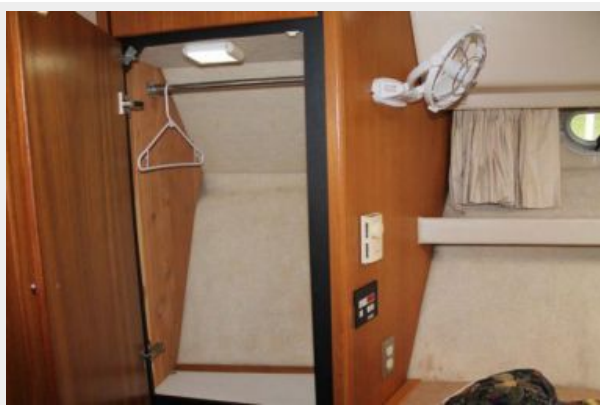
Master Stateroom Locker Port