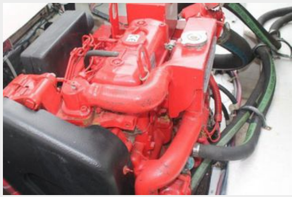
8.0 KW Westerbeke Generator