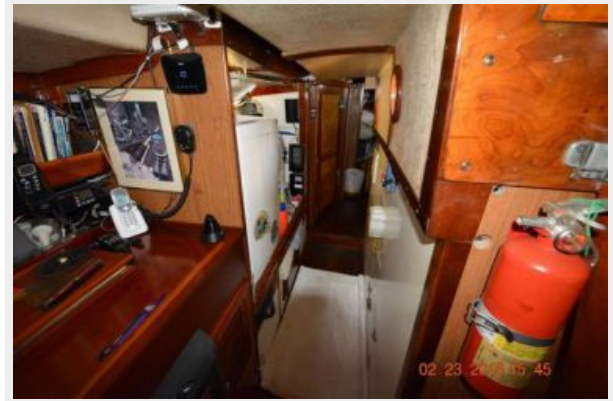
Passage way starboard side