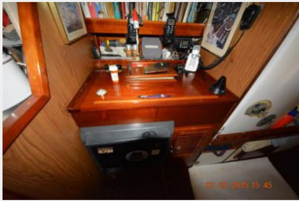
Navigation center starboard side