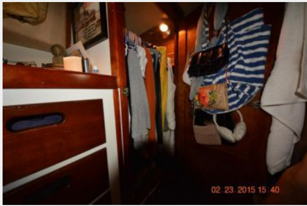
Forward stateroom hanging closet