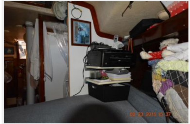
Forward stateroom facing aft