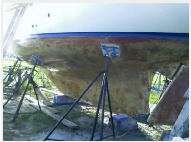
Planing off gelcoat below boot stripe