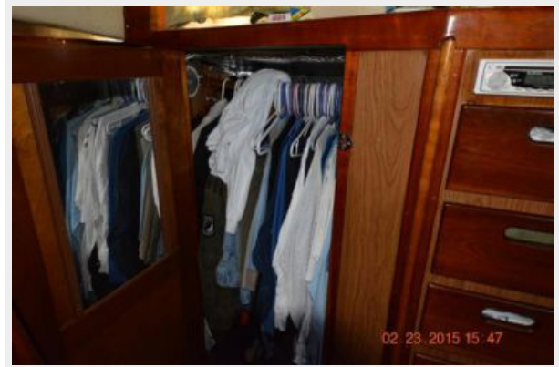
Master stateroom hanging closet starboard side