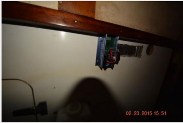
One of three Isolaters