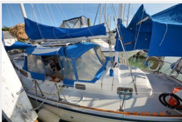
Midship port side