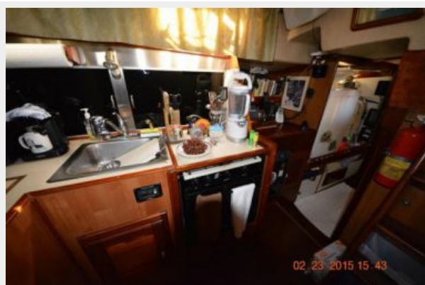
Galley starboard side