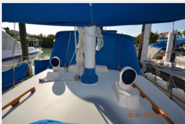
Bow deck facing aft