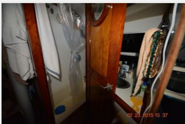
Forward stateroom bath tub/sink