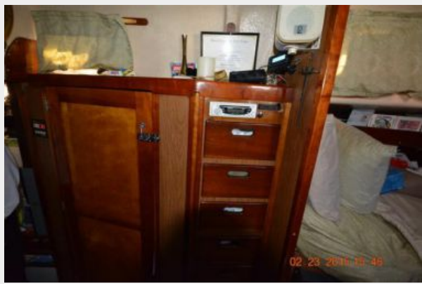
Master stateroom starboard side hanging closet/drawers