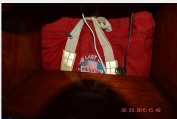
Medical Sea Pack