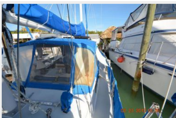
Starboard aft deck facing forward