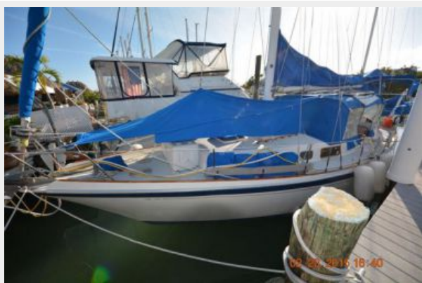
Port bow side