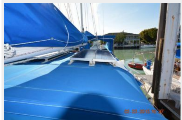
Starboard bow deck facing aft