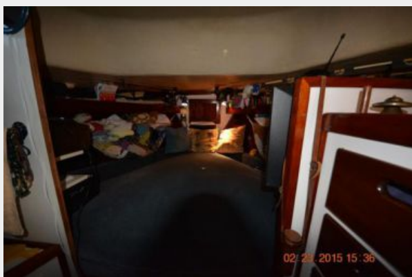
Salon facing forward