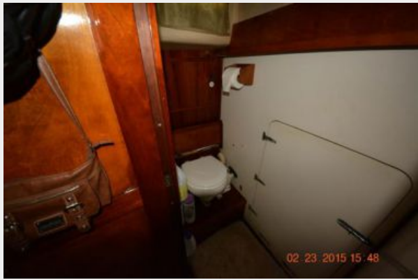
Master head, engine room access door