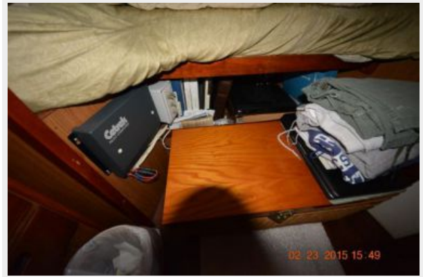
Master stateroom access to topside cockpit Master stateroom access to topside cockpit