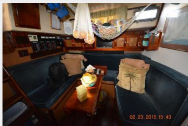
Salon dinette port side