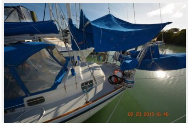
Port aft quarter