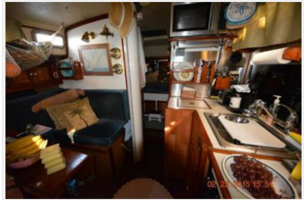
Passage way facing forward