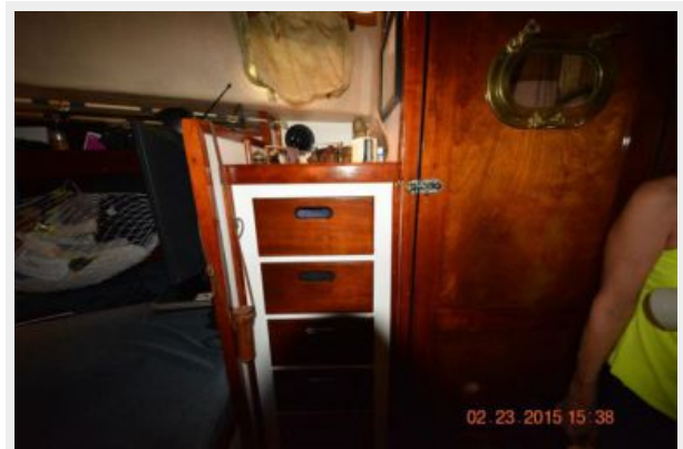
Forward stateroom clothes drawers