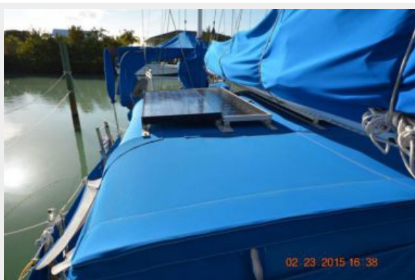
Port bow deck facing aft