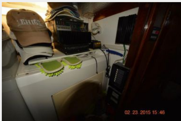
Dryer starboard side