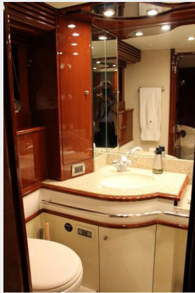
Bow VIP Head (2)