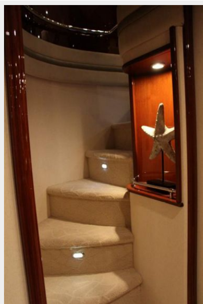
Lower Companionway Stairs