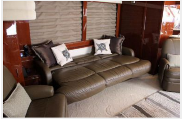
Salon Sofa - Converts Into Sleeper