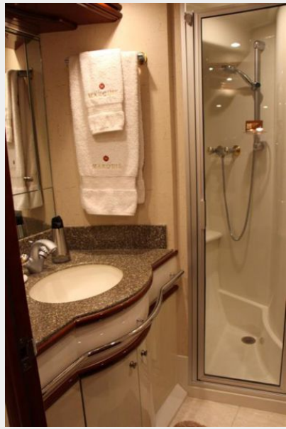
Port Stateroom / Day Head