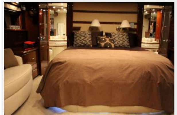
Master Stateroom / Full Beam Layout