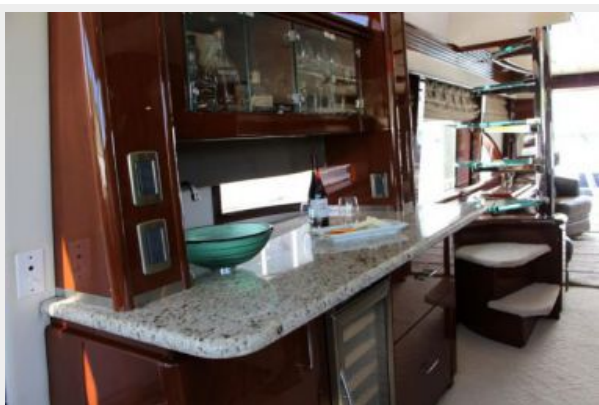
Galley Bar / Starboard