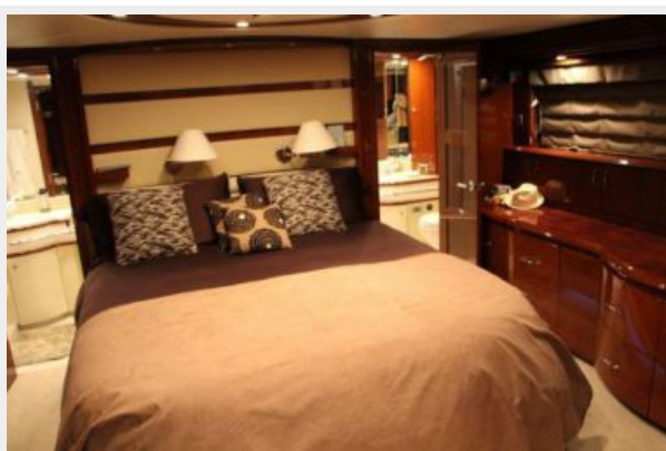
Master Stateroom Curved Dressers to Port & Starboard