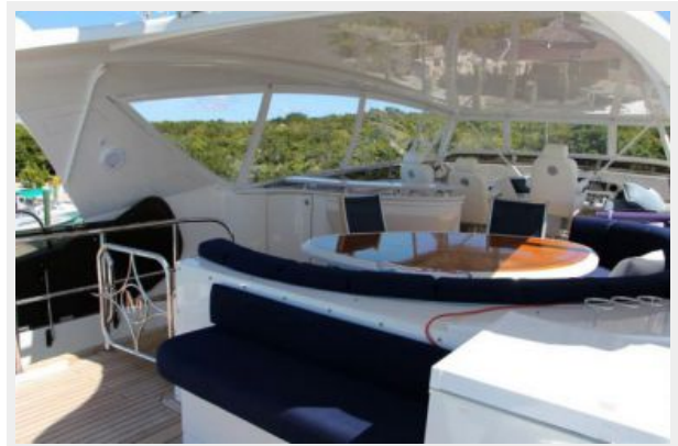
Bridge to Port