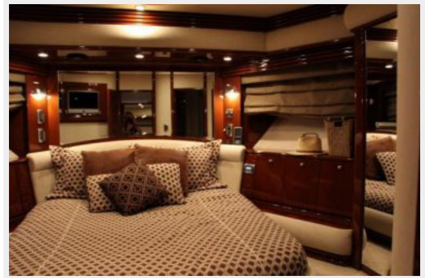
Bow VIP Stateroom