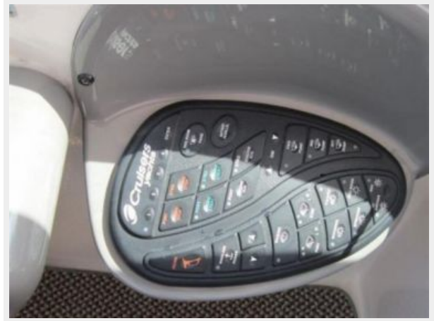
Helm Keyless Touchpad