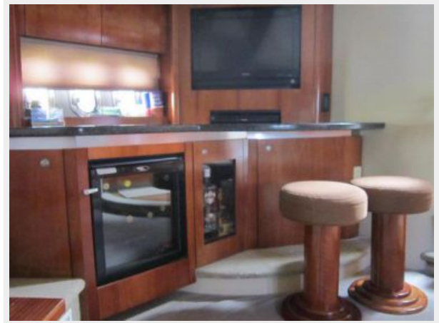
Salon Entertainment Center