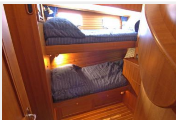
Guest Stateroom Starboard