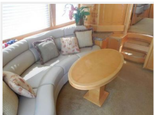
PortSide Main Salon