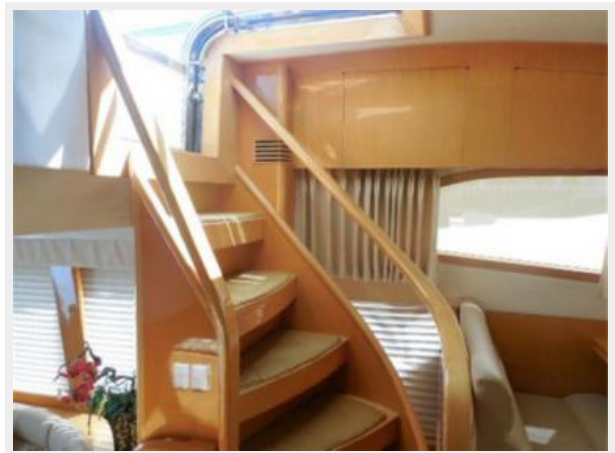
Salon Stairs to FlyBridge