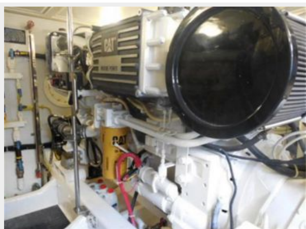
Engine Room - Cat's