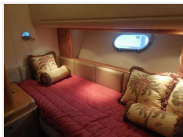
Twin Bunk Stateroom