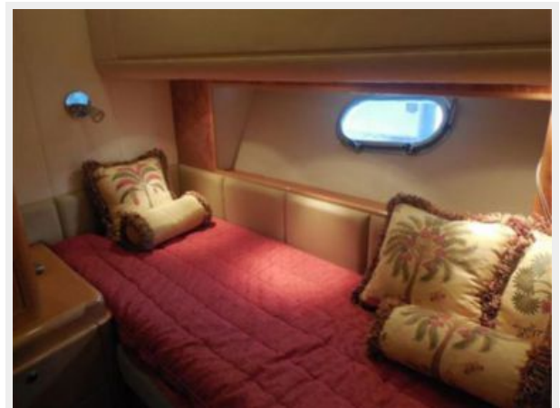
Twin Bunk Stateroom