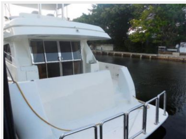
Beach / Swim Platform