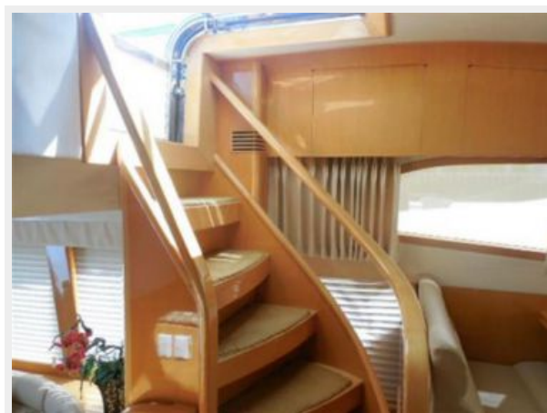
Salon Stairs to FlyBridge