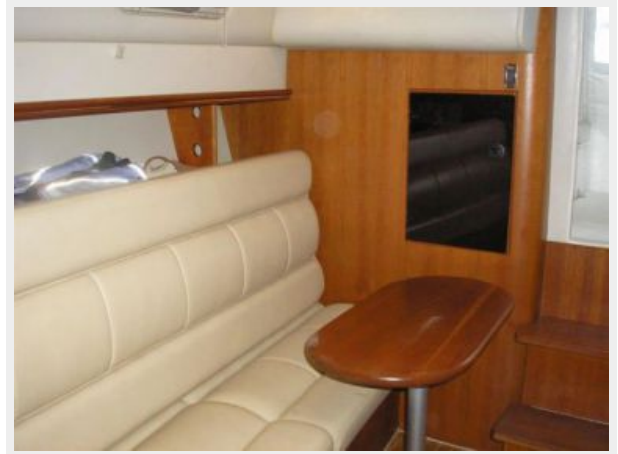
Starboard View Looking Aft