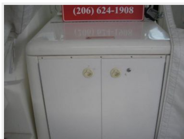
Cockpit Tackle Locker