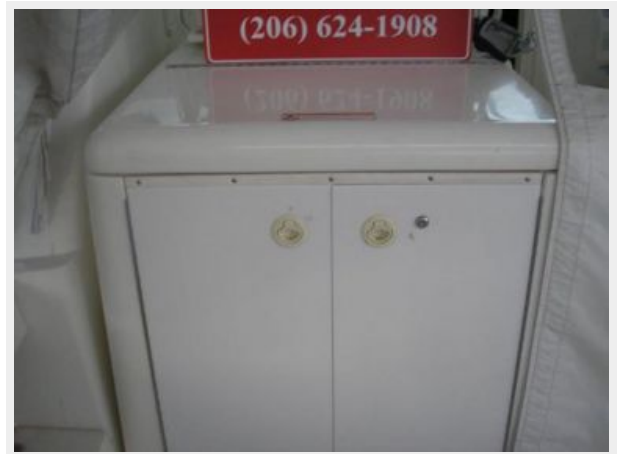
Cockpit Tackle Locker