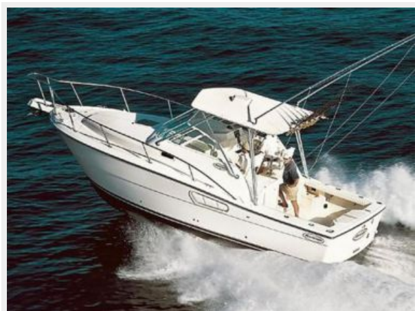
31 Rampage Express Sistership