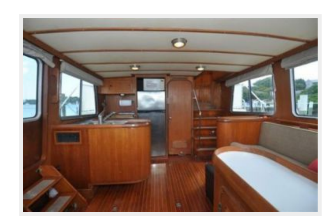
Main salon aft