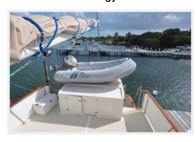
Custom dingy mount