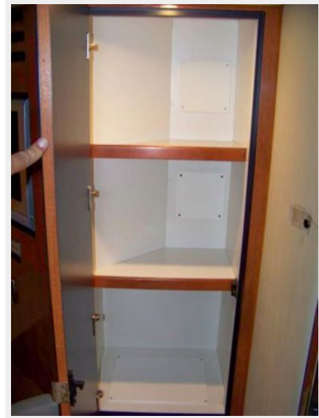
Forward cabin locker