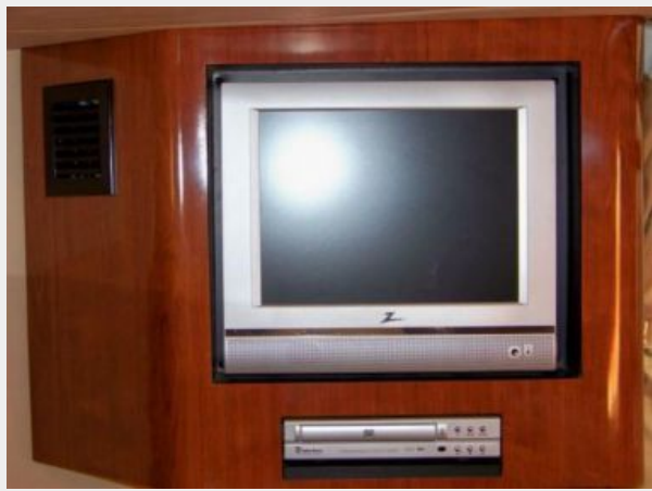
aft cabin TV