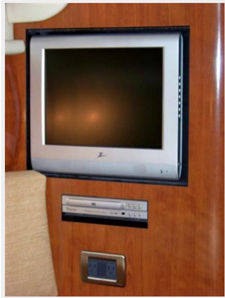
Forward cabin TV