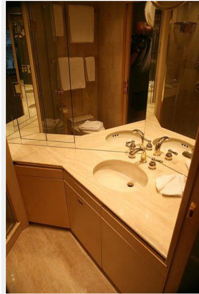
His Master Bathroom