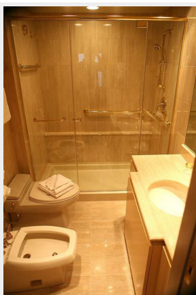
Hers Master Bathroom