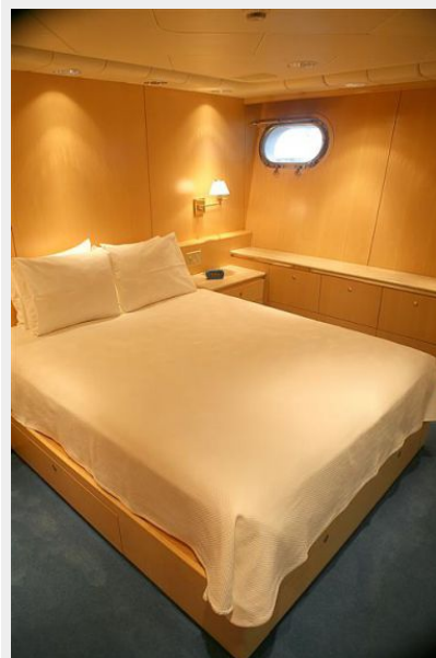
Port Aft Guest Stateroom