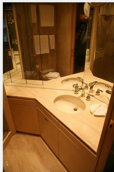
His Master Bathroom