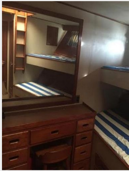
Forward Berth #2