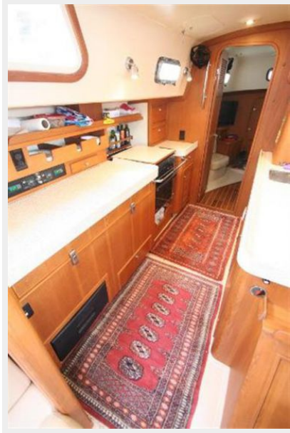
Looking aft along galley