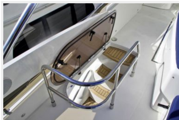
Access Door To Flybridge