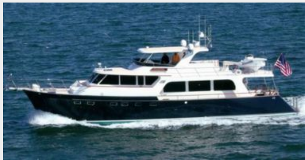
Running Port Profile