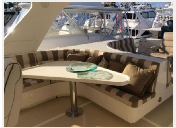
Flybridge Forward Settee