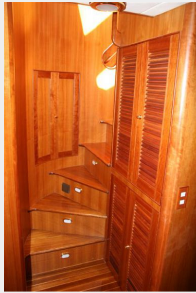
Washer Dryer Cabinet