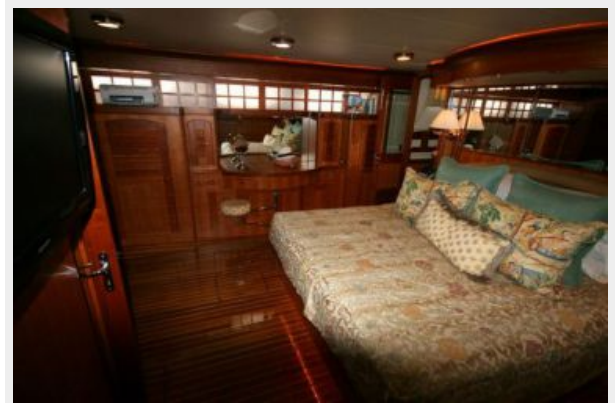
Master Stateroom Starboard