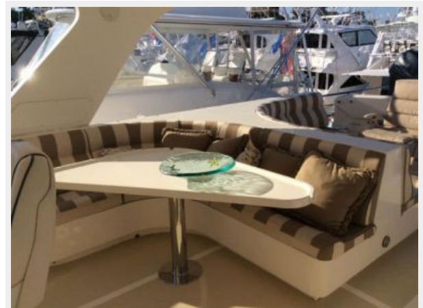
Flybridge Forward Settee