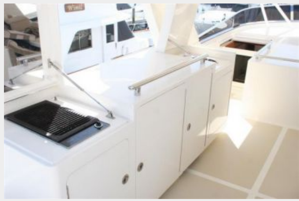
Flybridge Wet Bar & Barbecue