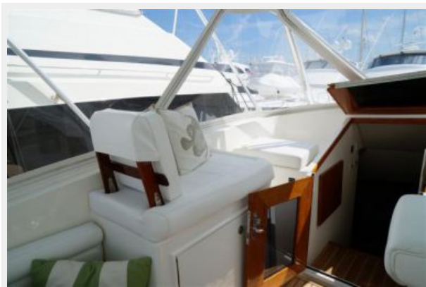
Port Side Companion Lounge Seating