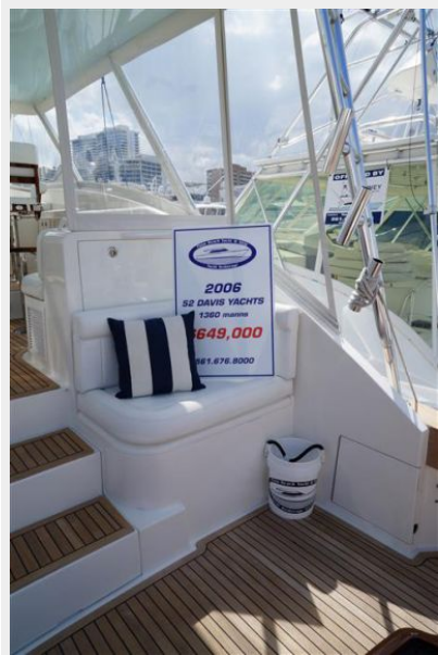
Starboard Side Cockpit Seating