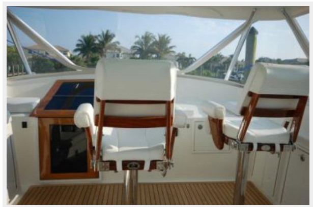
Helm & Companion Chair