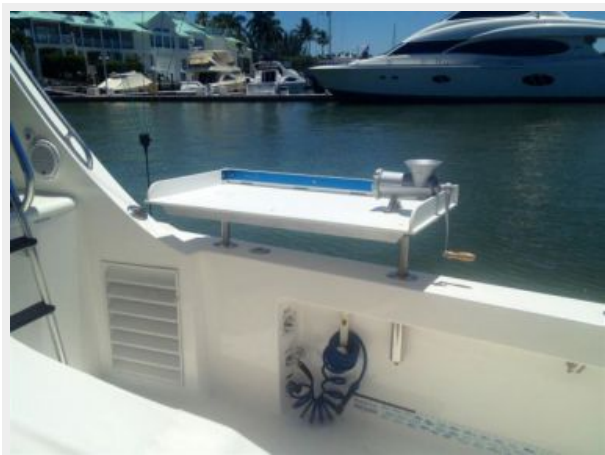
Fish Cleaning Station