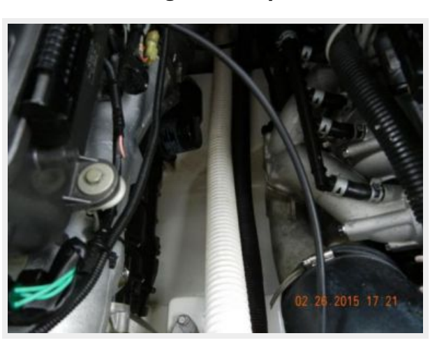
Bow View on 2012 Continental Trailer