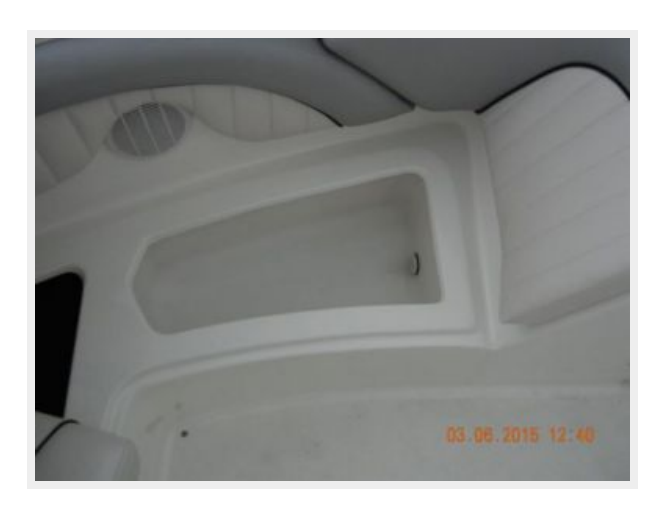
36 Qt built-in Ice Chest