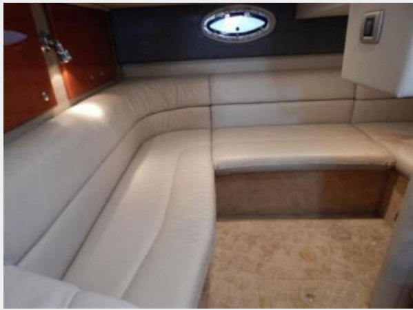
Aft Cabin 2