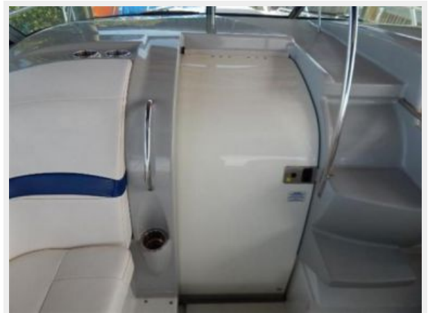
Companion way door