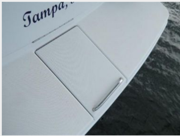
Swim Platform Ladder Closed