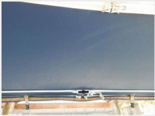
Bimini Canvas 1