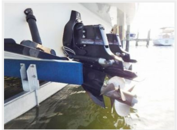
Out Drive Port