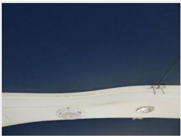
Bimini Canvas 5