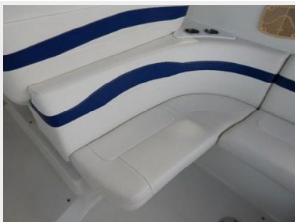
Cockpit Settee 2