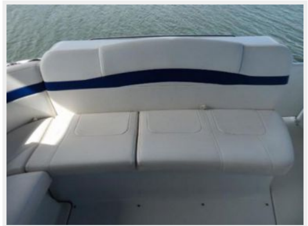
Cockpit Settee 1