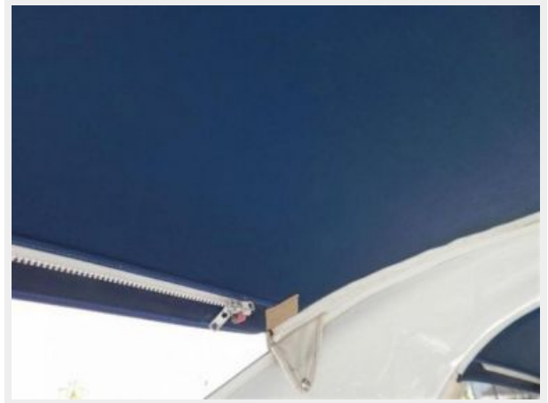
Bimini Canvas 2