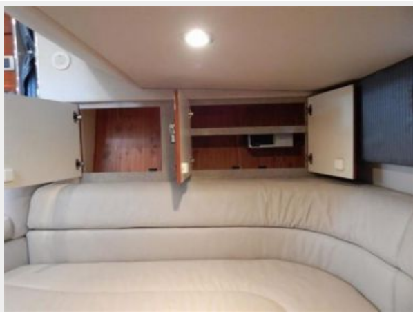
Aft Cabin Storage 2