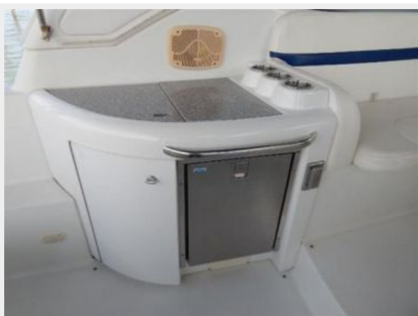
Cockpit Sink Fridge Station