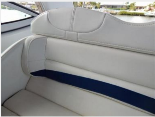
Cockpit Settee 4