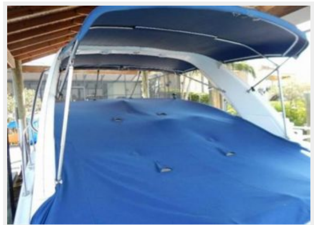
Full Canvas Cover