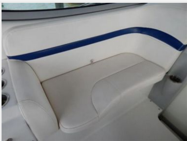
Cockpit Settee 6