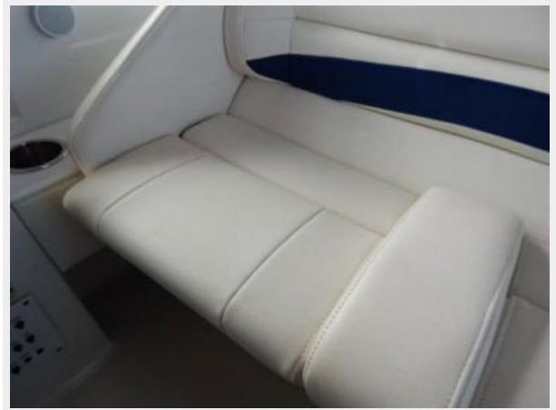
Cockpit Settee 5