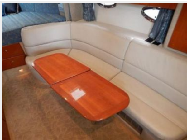
Salon Table Full Option