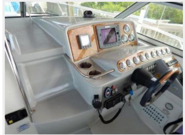
Helm Station 1