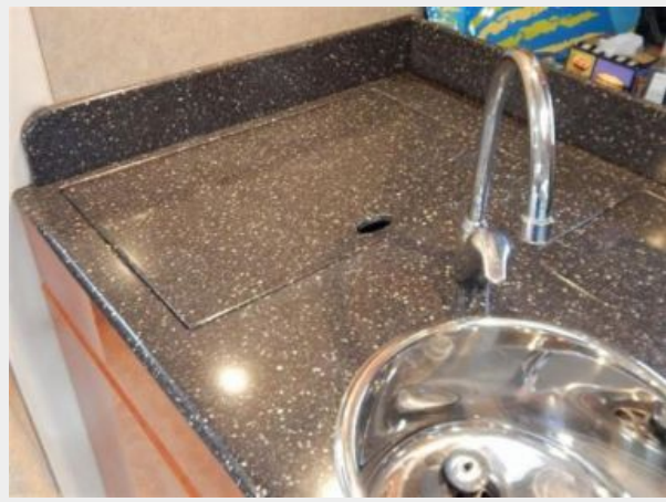
Galley Stove Top Closed