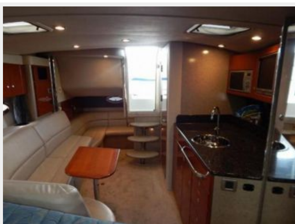
Salon view from V Berth