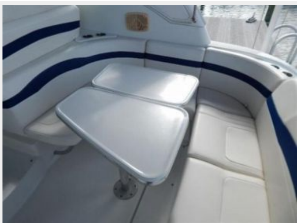
Cockpit Table Full