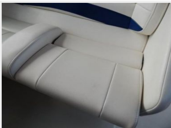
Helm Seat Close Up 1