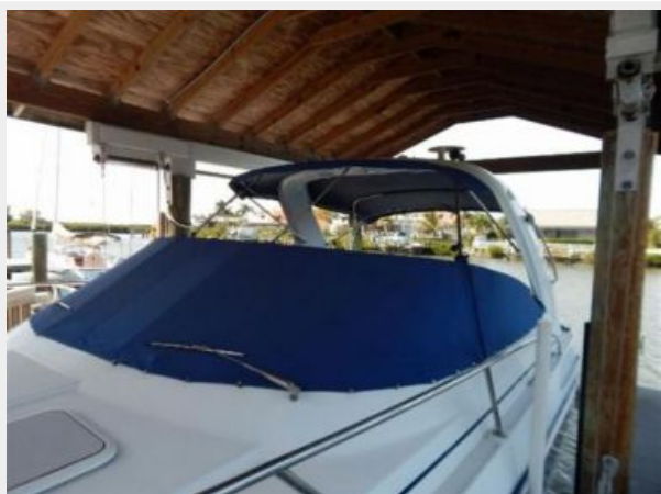
Full Canvas Cover 2