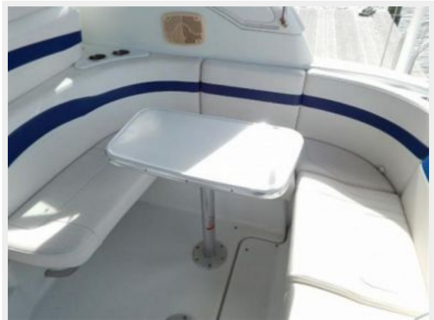
Cockpit Table Half