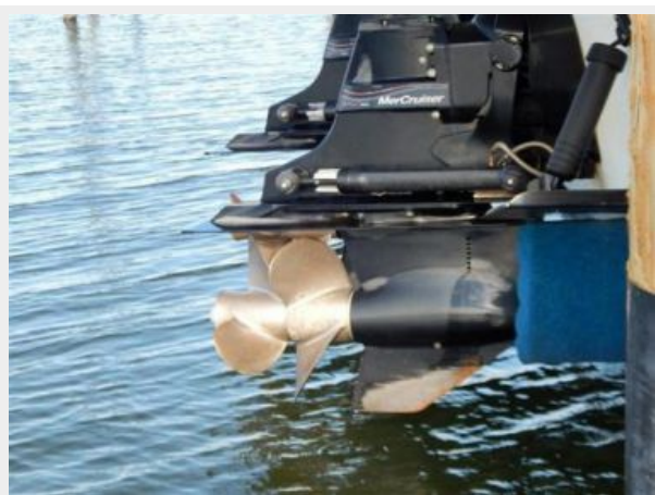
Out Drive Starboard