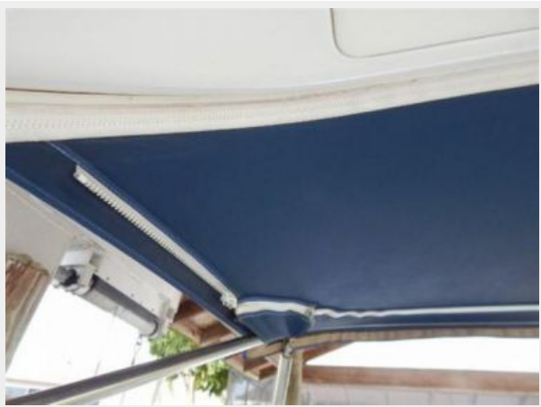
Bimini Canvas 3