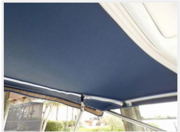
Bimini Canvas 4