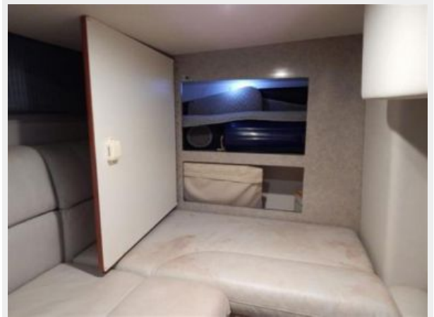
Aft Cabin Storage