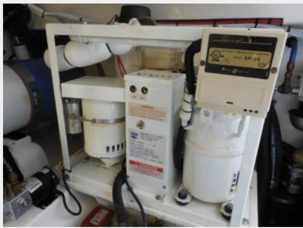
Eskimo Ice Chipper