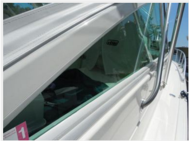
Window Frame Condition