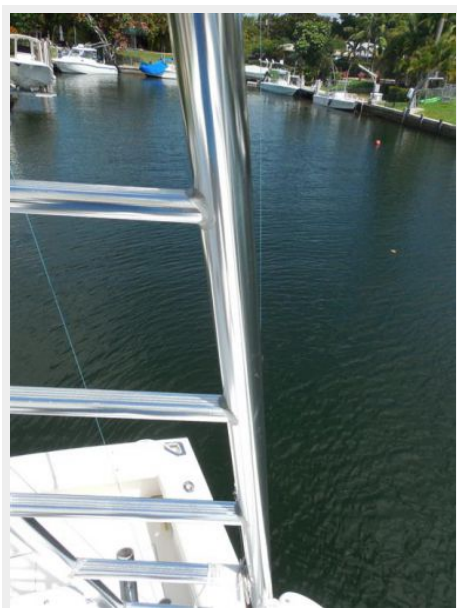
Tower Metal Condition