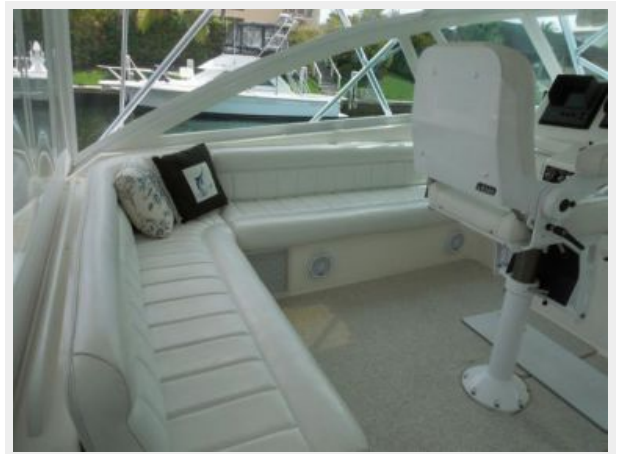
Helm deck Seating Port