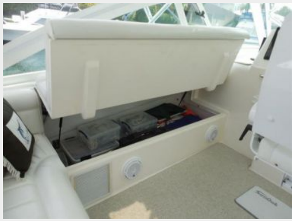
Helm Deck Port Storage