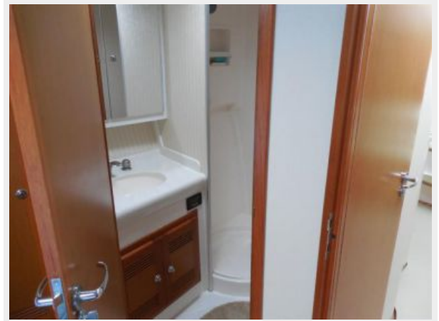
Head from Master