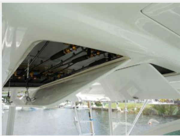
Helm Deck Rod Storage