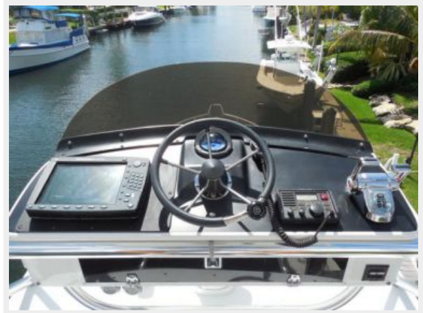
Tower Helm Station