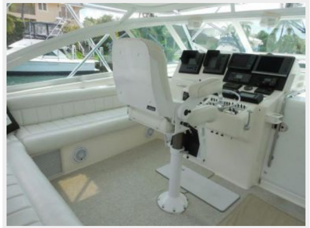
Helm Deck Port