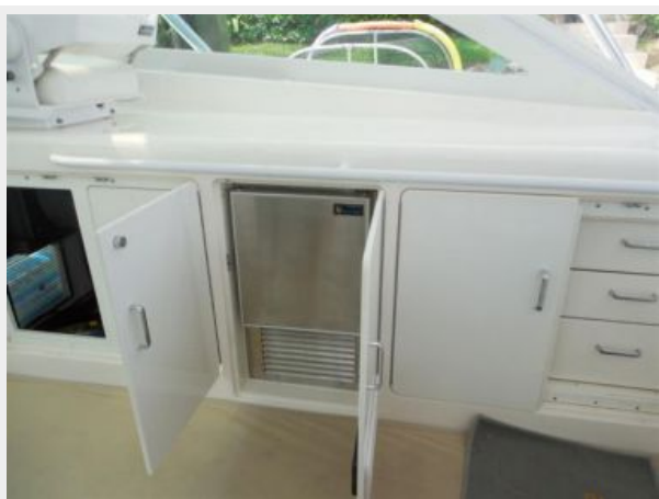
Helm Deck Starboard Storage and Ice Maker