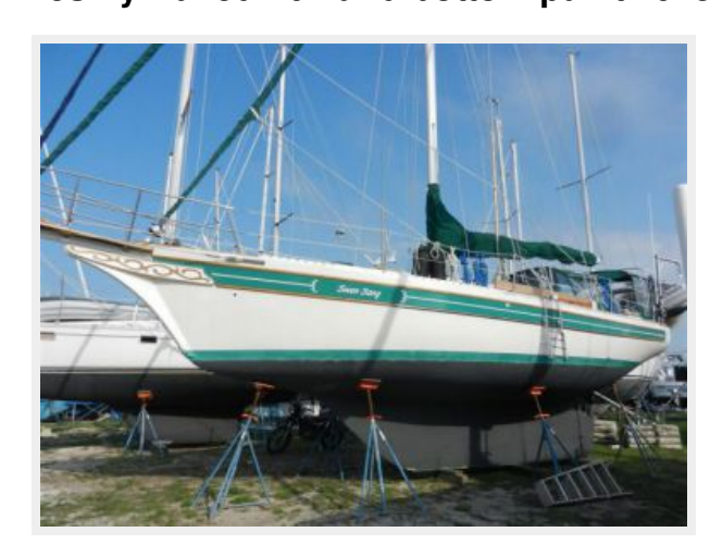
Freshly waxed hull and bottom paint 2015