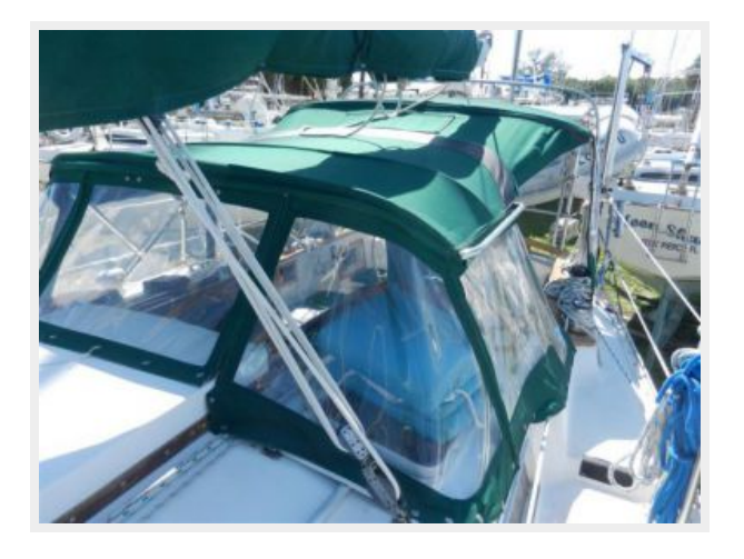
Full enclosure in good condition