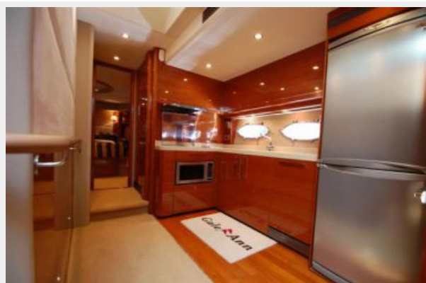
Galley forward view