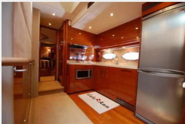
Galley forward view