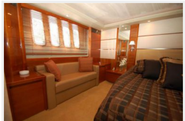
Master Stateroom Settee