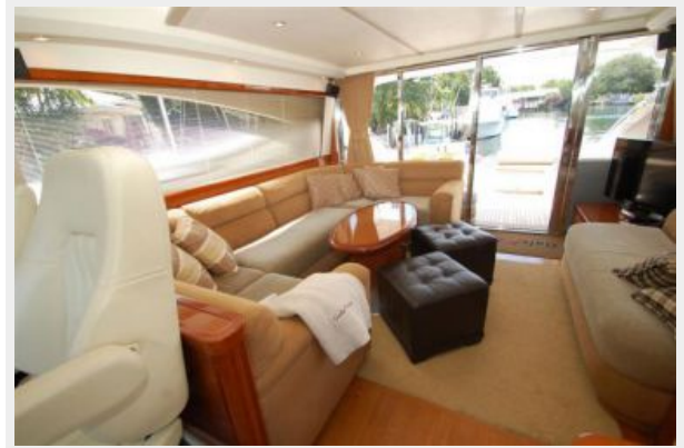
Saloon looking aft