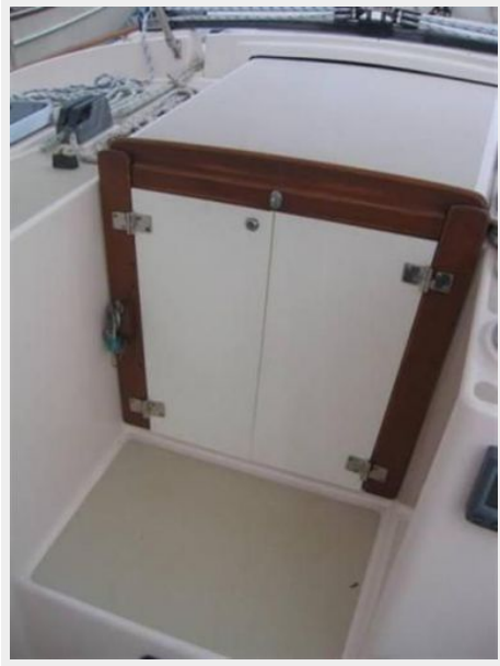
CAFE STYLE DOORS (CLOSED)