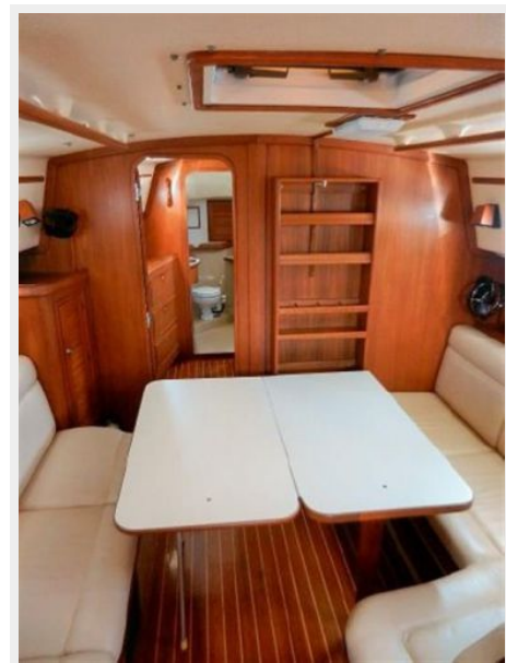
SALON W/ TABLE DOWN