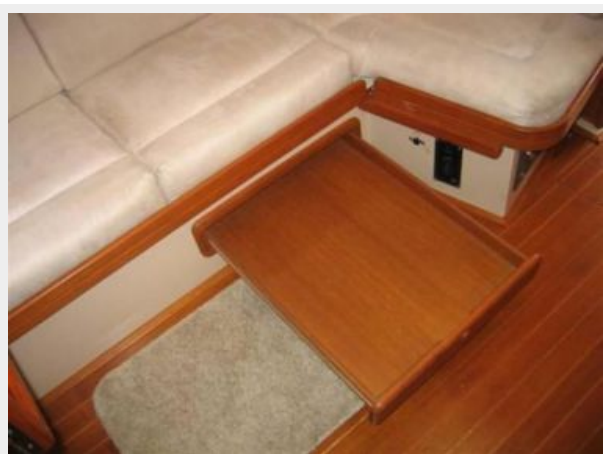
LARGE CHART DRAWER