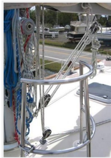
MAST AND BOOM W/ VANG