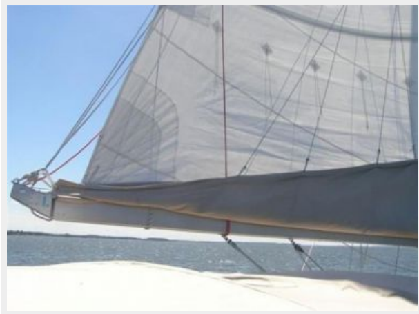
MAINSAIL W/ DOYLE AND STACKPACK