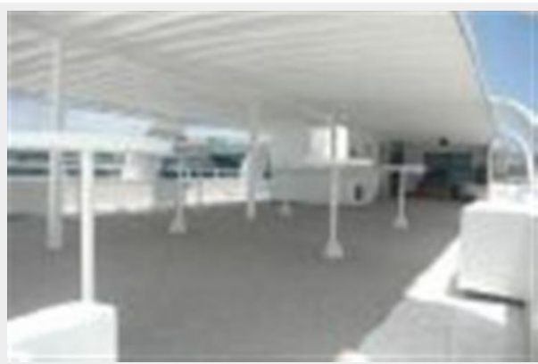
4th Deck | Sky Lounge 3