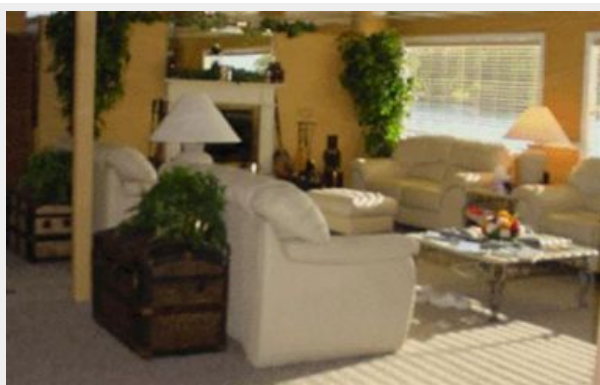
Main Deck | Salon 1