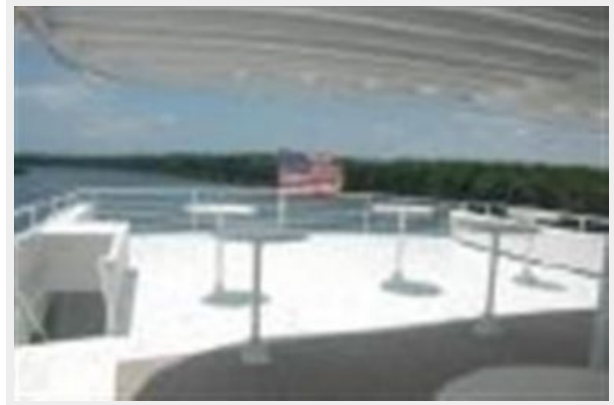
4th Deck | Sky Lounge 2