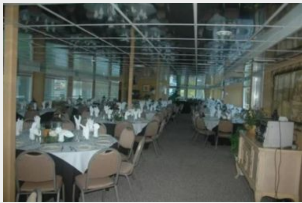
2nd Deck | Formal Dining 1