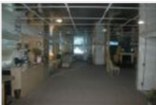
Main Deck | Salon 3