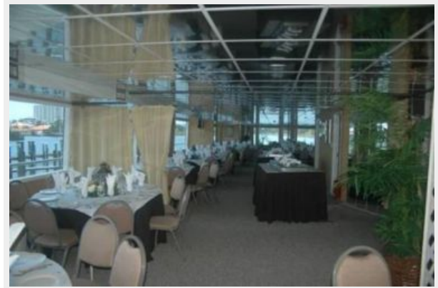
2nd Deck | Formal Dining 2