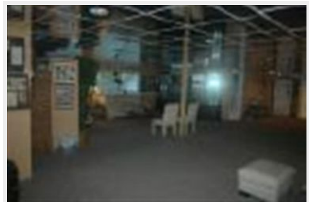
Main Deck | Salon 2