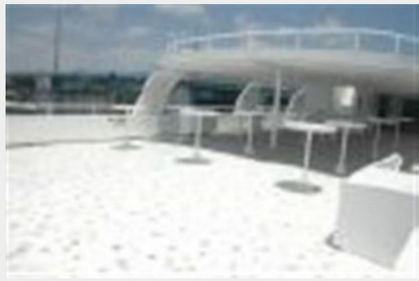
4th Deck | Sky Lounge 1