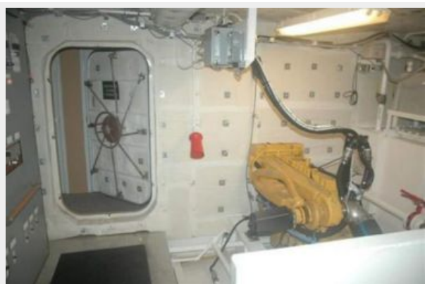
Engine Room 2