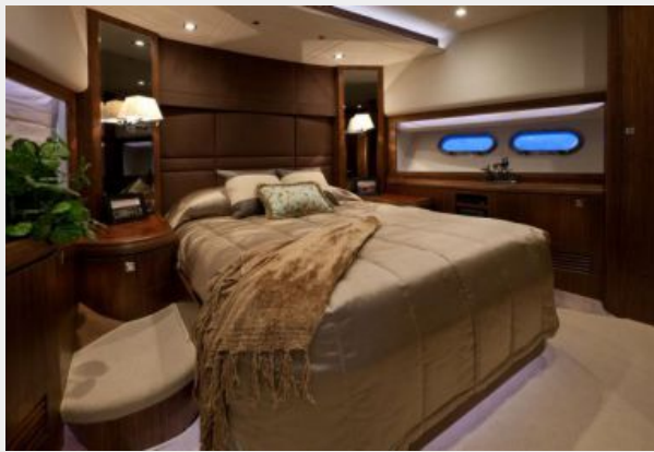
VIP Guest Stateroom