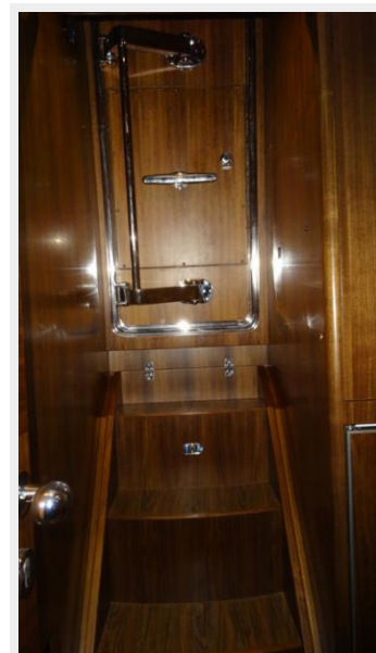
Crew Access to Cockpit