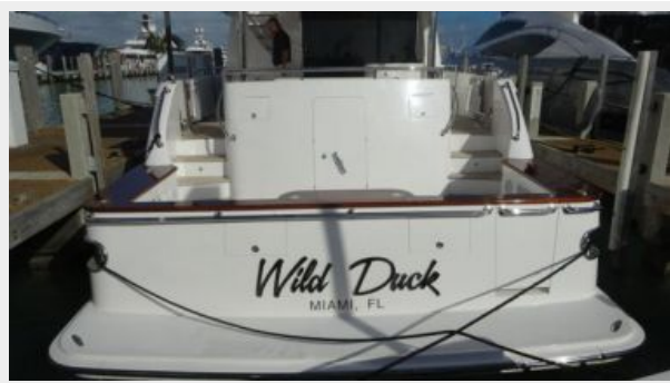
Transom Swim Platform