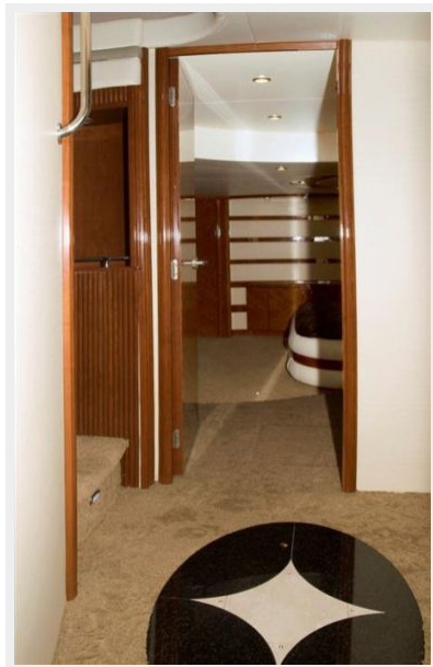
LOWER DECK FOYER