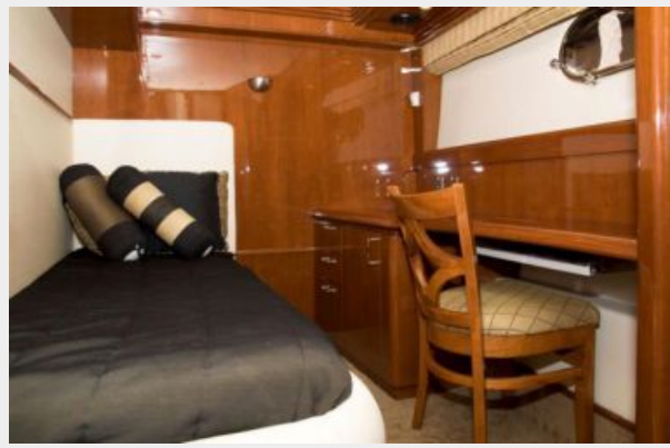
GUEST/CREW STATEROOM 1