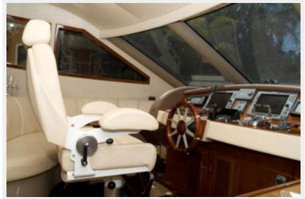
LOWER HELM 1