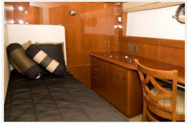
GUEST/CREW STATEROOM 2