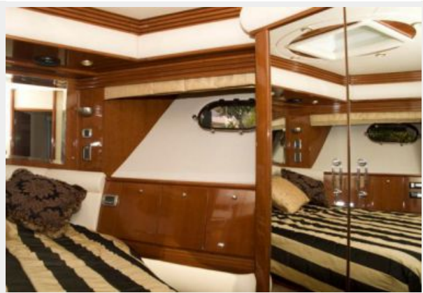
VIP STATEROOM TO STBD