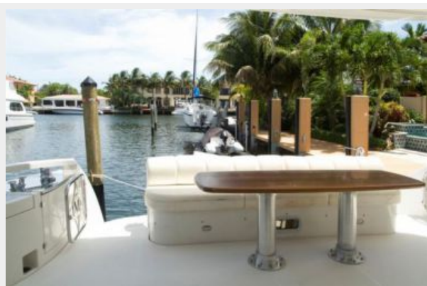
AFT DECK 1