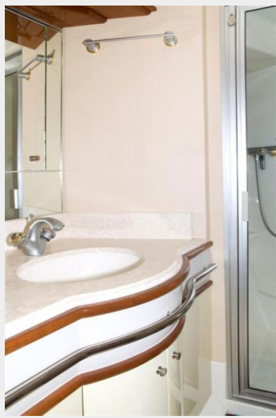
VIP HEAD 2