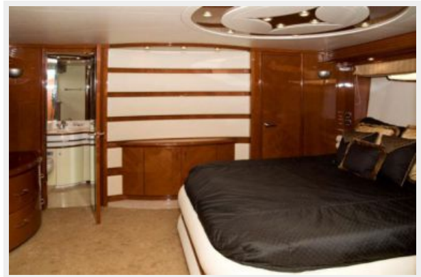
HIS & HER HEADS