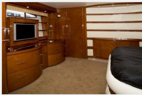
MABUREAU & CREDENZA