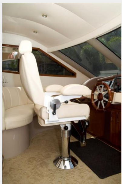
LOWER HELM 2