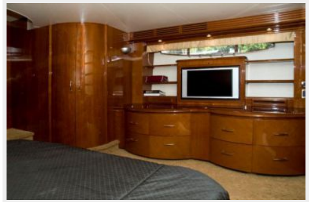
BUREAU & WALK-IN CLOSET