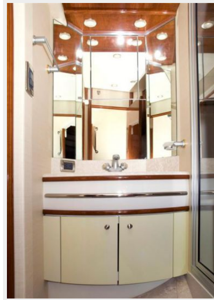
VIP HEAD 1