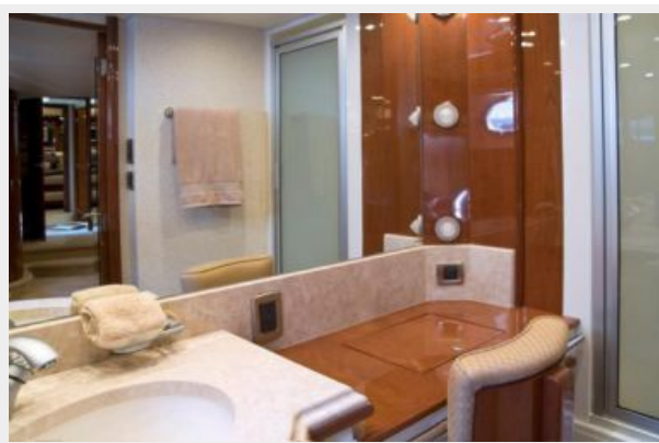
MASTER HEAD - HER SIDE 1